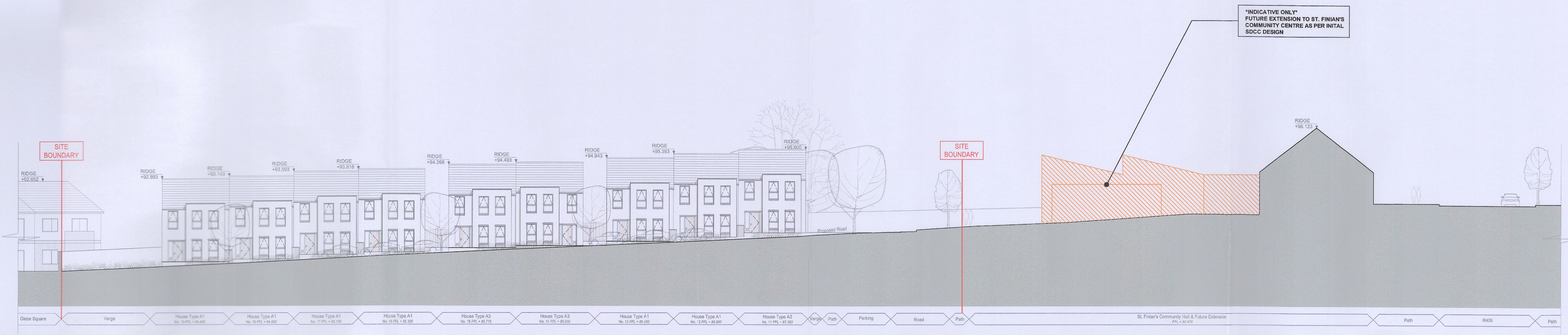
Contiguous Elevation - View A-A