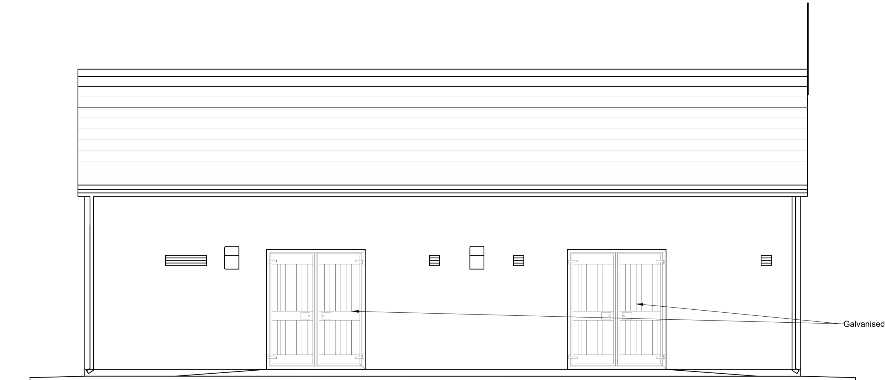
SOUTH ELEVATION Scale 1:50