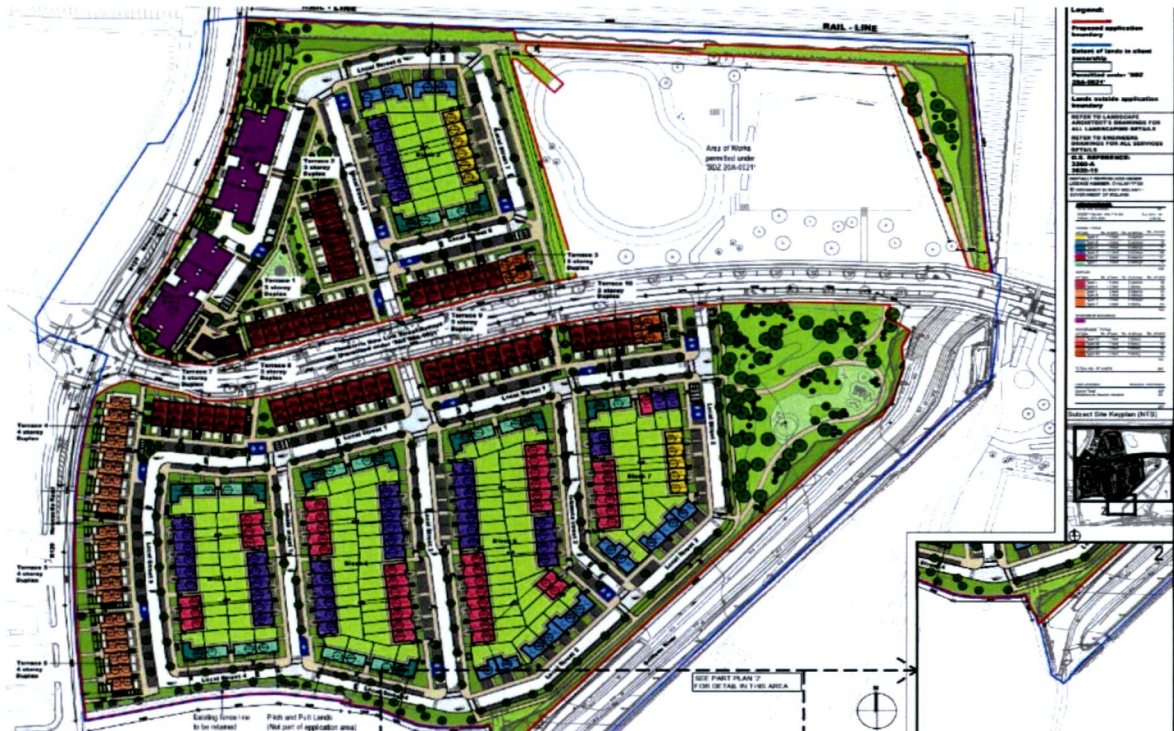
General Site Plan - Development Area

Document Title: - Building Life Cycle & Management Report.