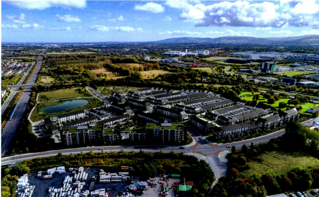
Figure 1 Aerial views of Proposed Development