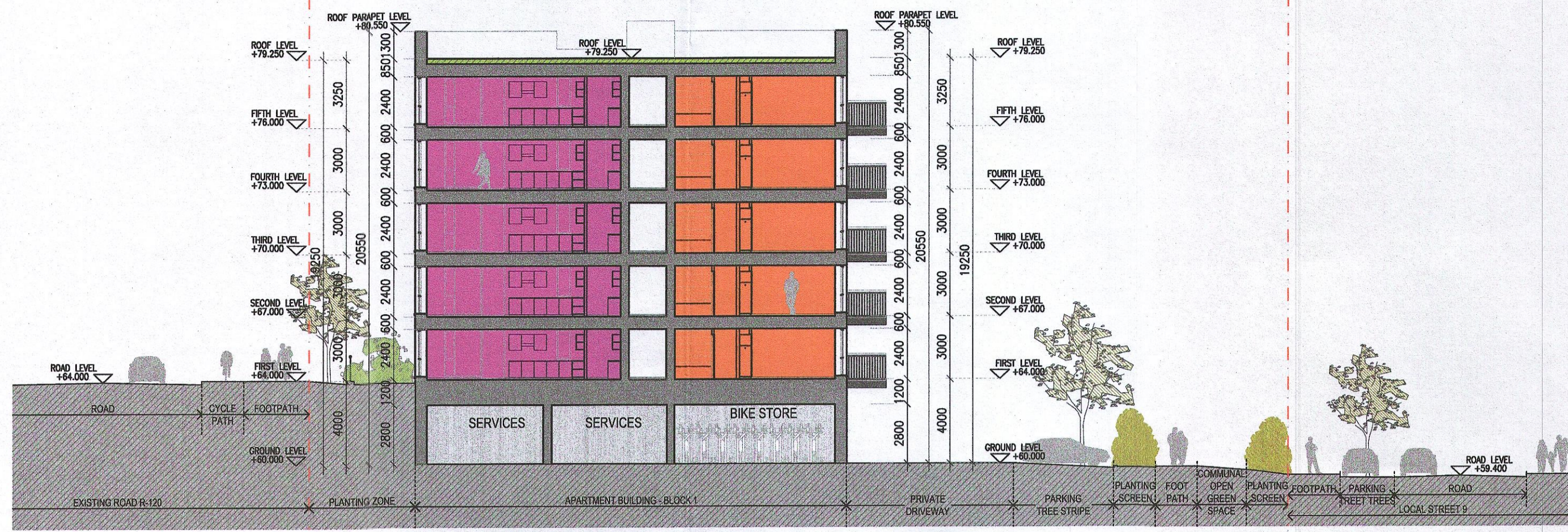
01 Proposed Section E-E P-501 1:200 @ A1