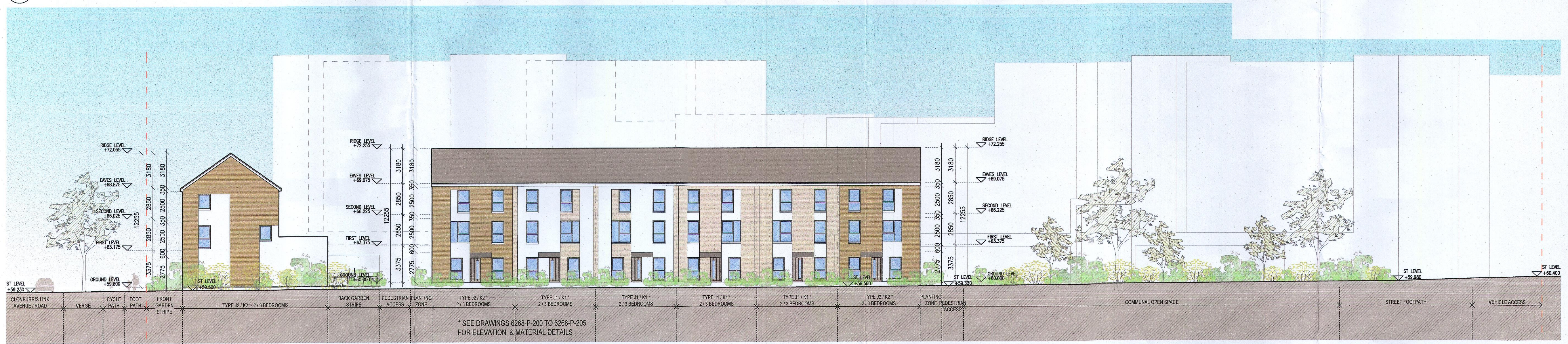
03 Proposed East Elevation 1:200 @ A1