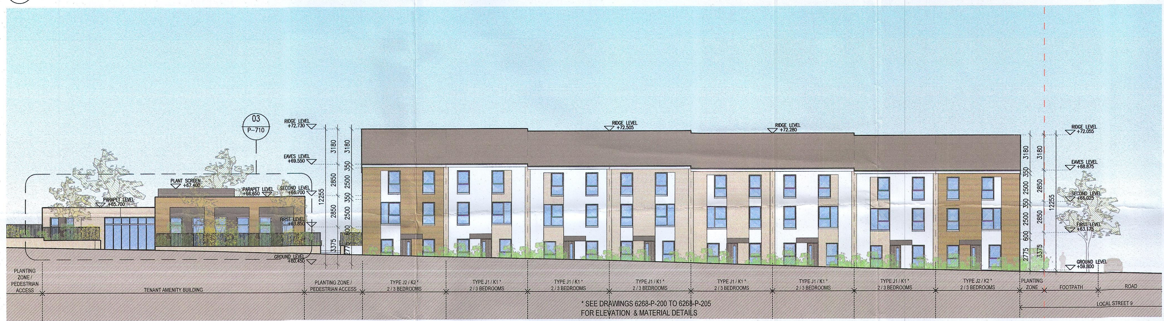
02 Proposed South Elevation 1:200 @ A1