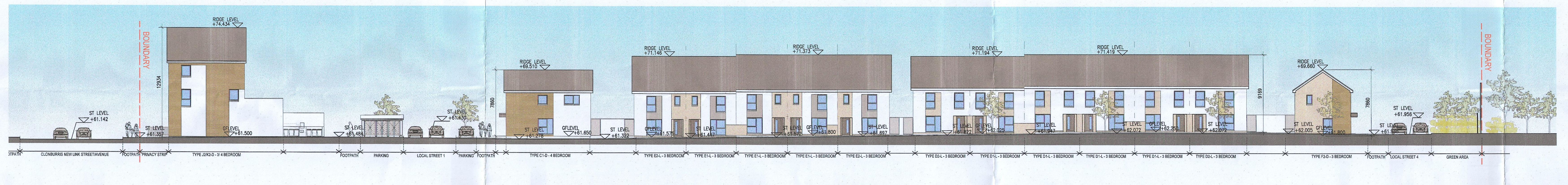
K-K P-054 Proposed Street Elevation K-K Intimate Street 1 Elevation looking East