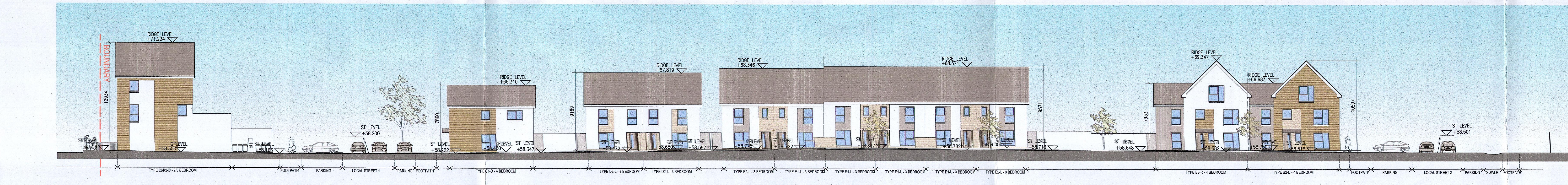
M-M P-054 Proposed Street Elevation M-M Intimate Street 2 Elevation looking East