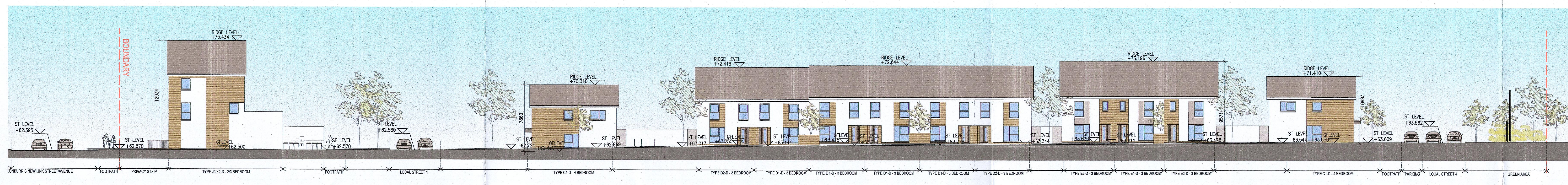
J-J P-054 Proposed Street Elevation J-J Local Street 5 Elevation looking East