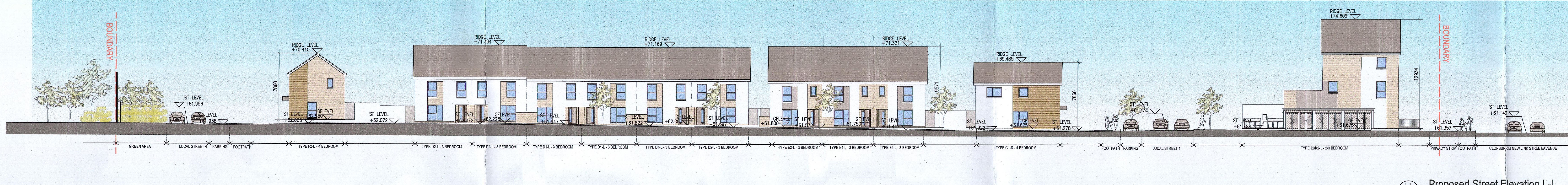
L-L P-054 Proposed Street Elevation L-L Intimate Street 1 Elevation looking West