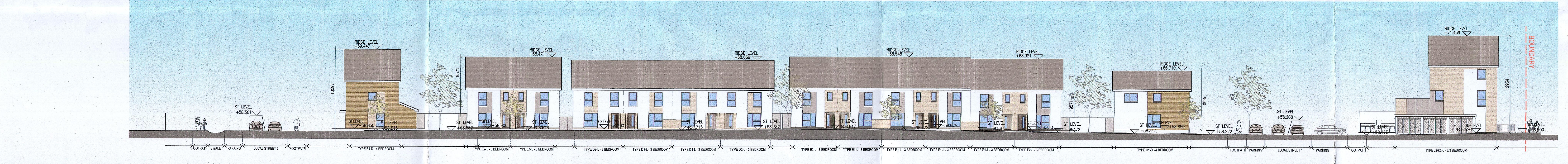
N-N P-054 Proposed Street Elevation N-N Intimate Street 2 Elevation looking West