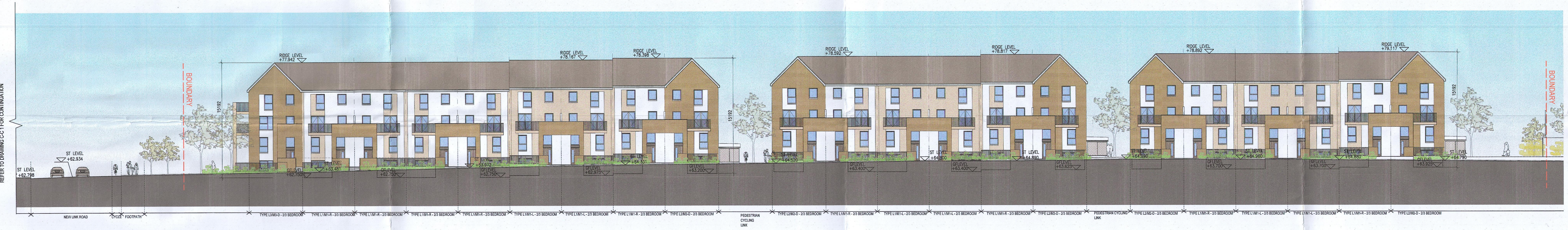
C-C2 Proposed Street Elevation C-C2 1:200 @ A0