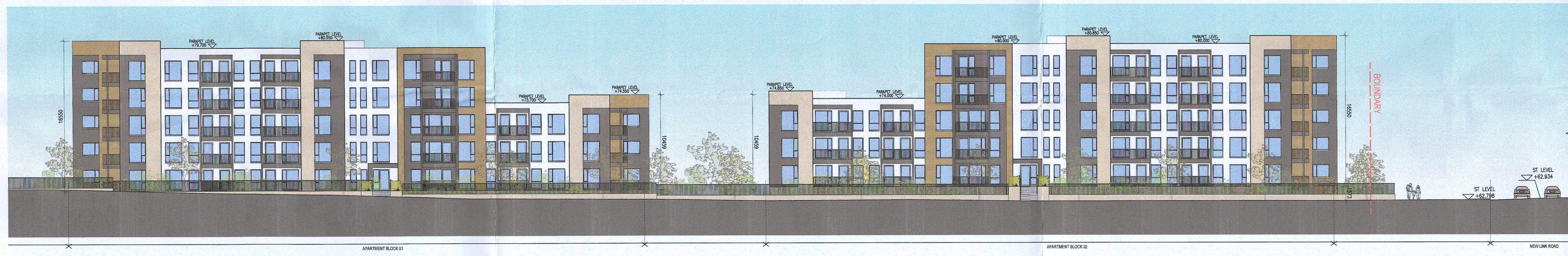
C-C1 Proposed Street Elevation C-C1 1:200 @ A0