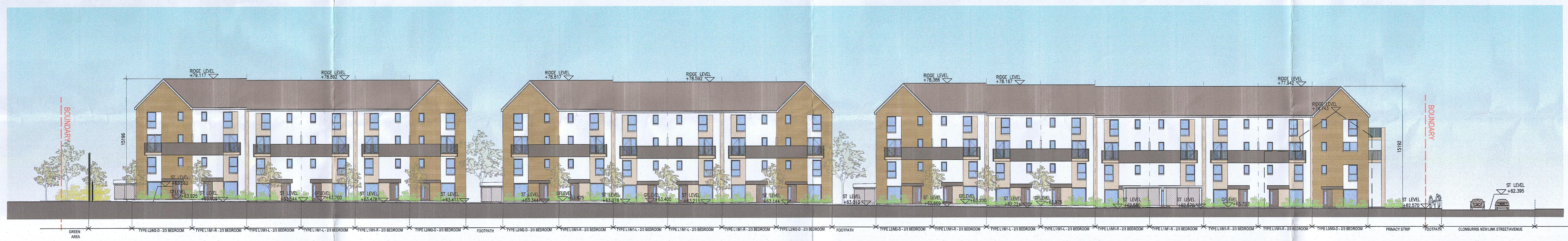
D-D Proposed Street Elevation D-D 1:200 @ A0