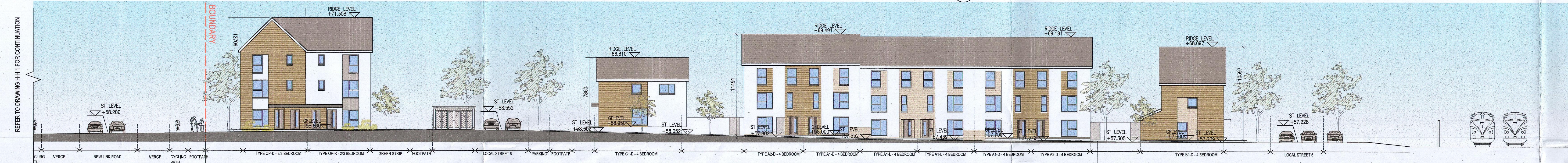
O-03 Proposed Street Elevation O-03 1:200 @ A1