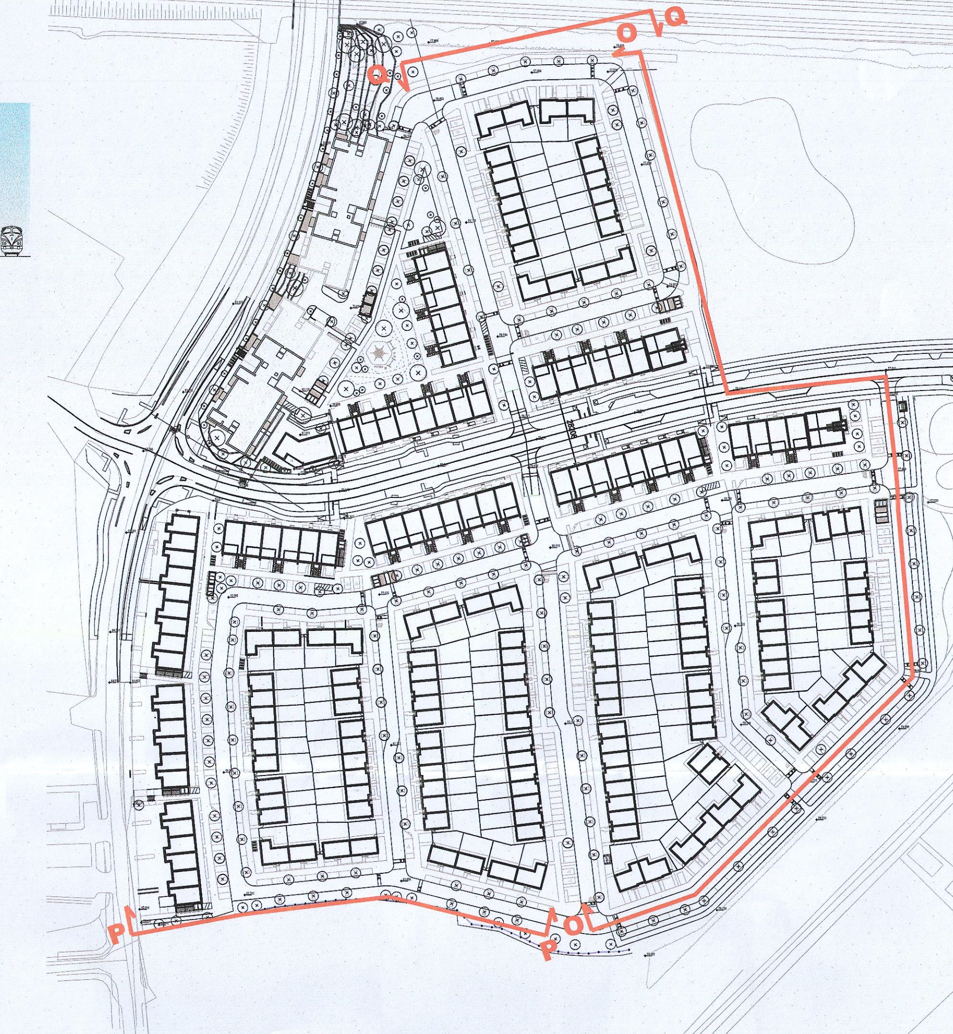
Keyplan Not to scale