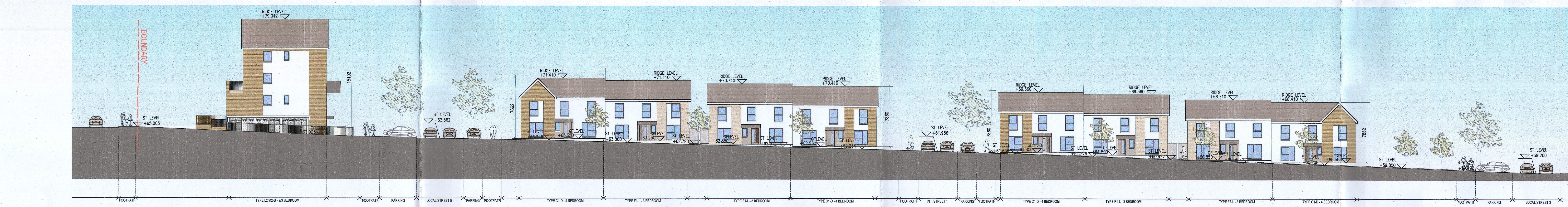
P-P Proposed Street Elevation P-P 1:200 @ A1 Local Street 4 Elevations looking North