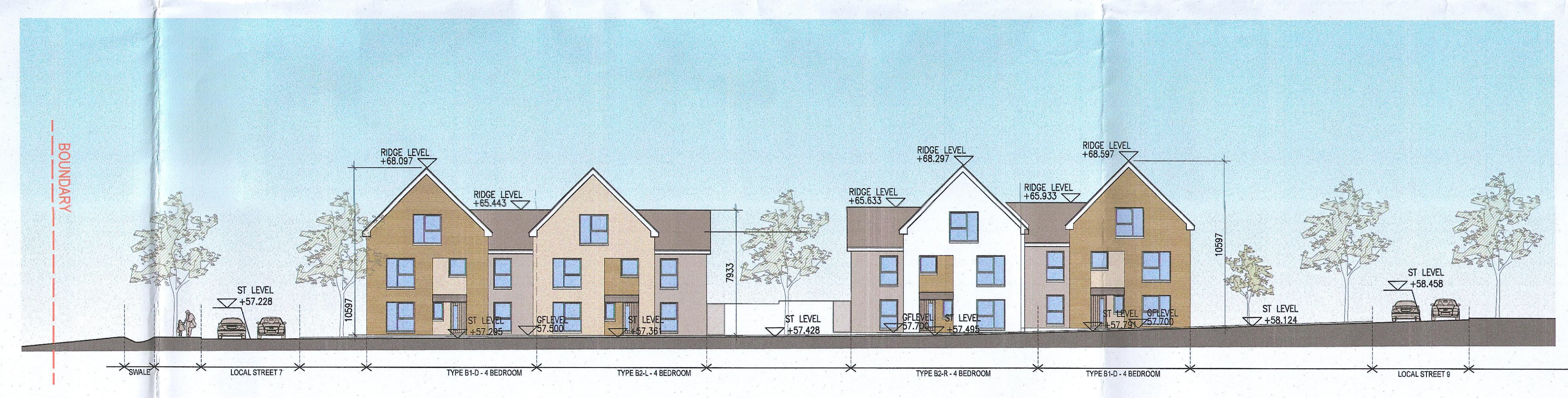
Q-Q Proposed Street Elevation Q-Q 1:200 @ A1 Local Street 6 Elevation looking South