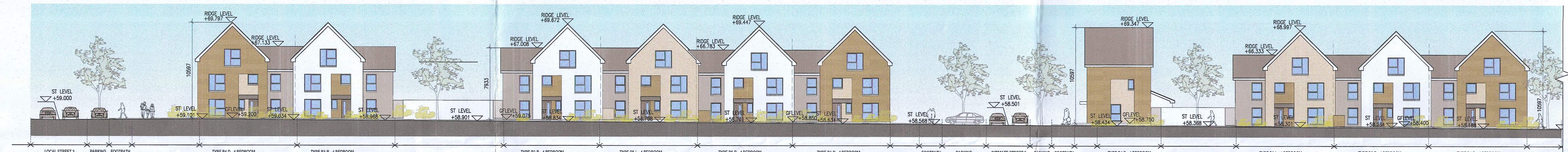
O-01 Proposed Street Elevation O-01 1:200 @ A0