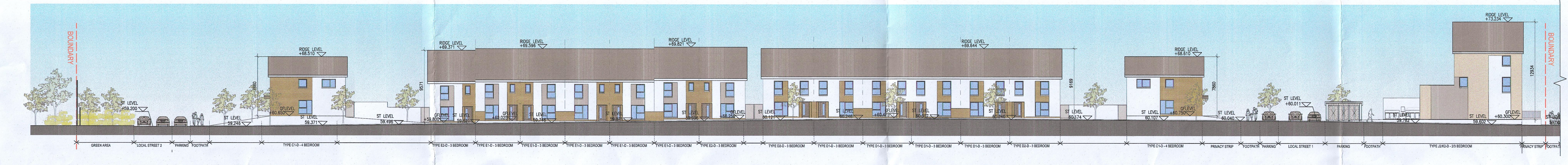
F-F1 P-005 1:200 @ AD Proposed Street Elevation F-F1