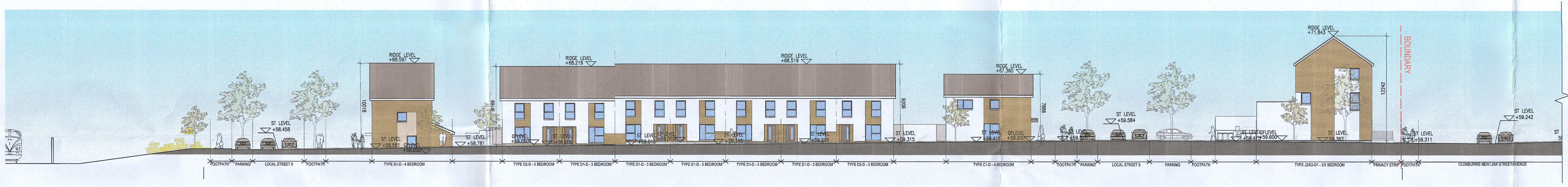
E-E1 P-002 1:200 @ AD Proposed Street Elevation E-E1