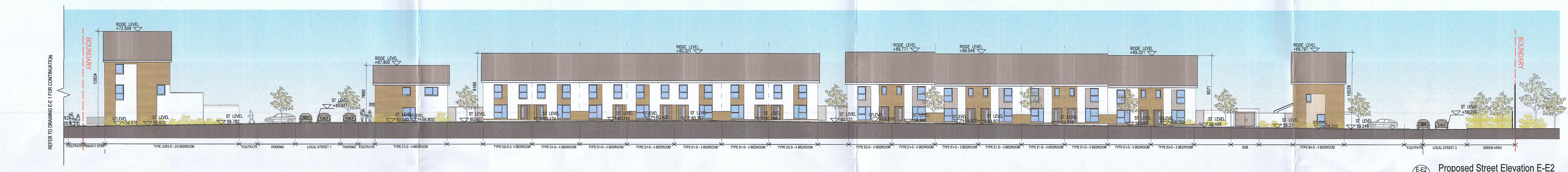
E-E2 P-003 1:200 @ AD Proposed Street Elevation E-E2