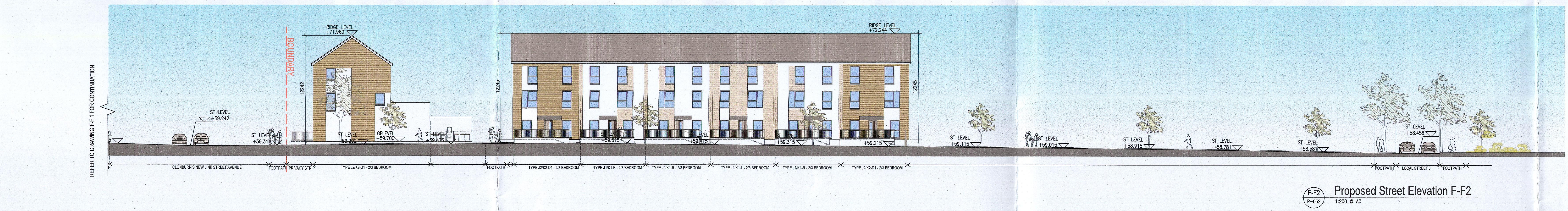
F-F2 P-006 1:200 @ AD Proposed Street Elevation F-F2