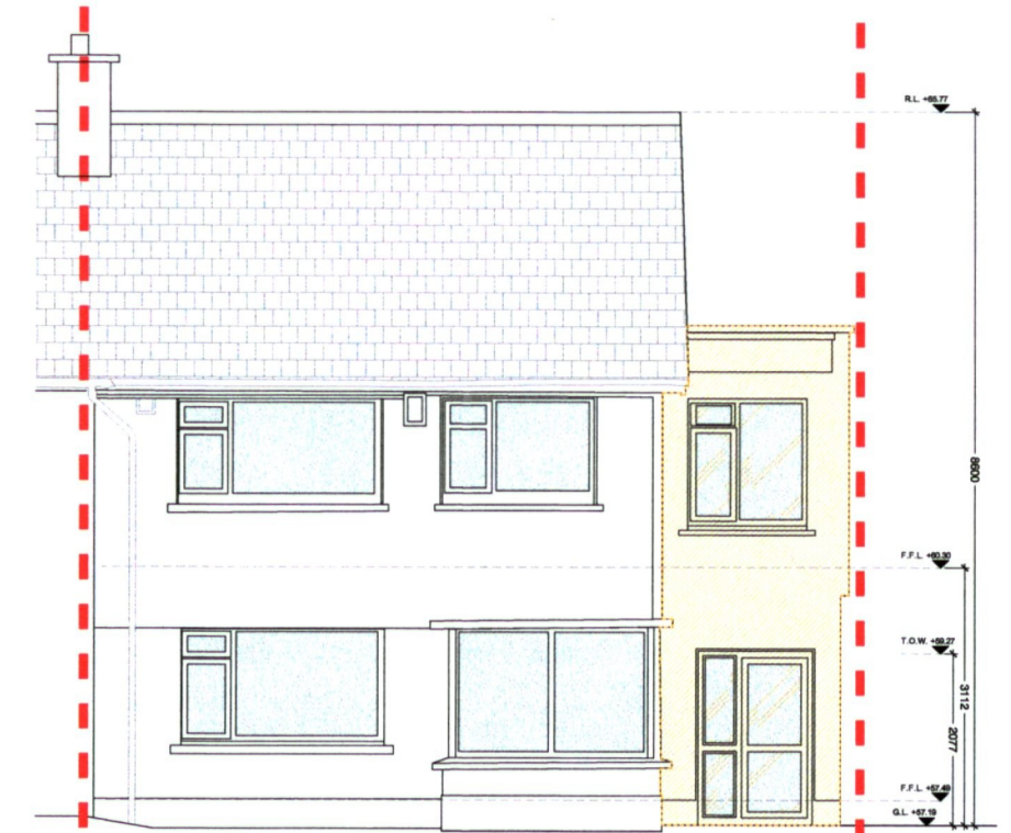
FRONT ELEVATION scale 1.100