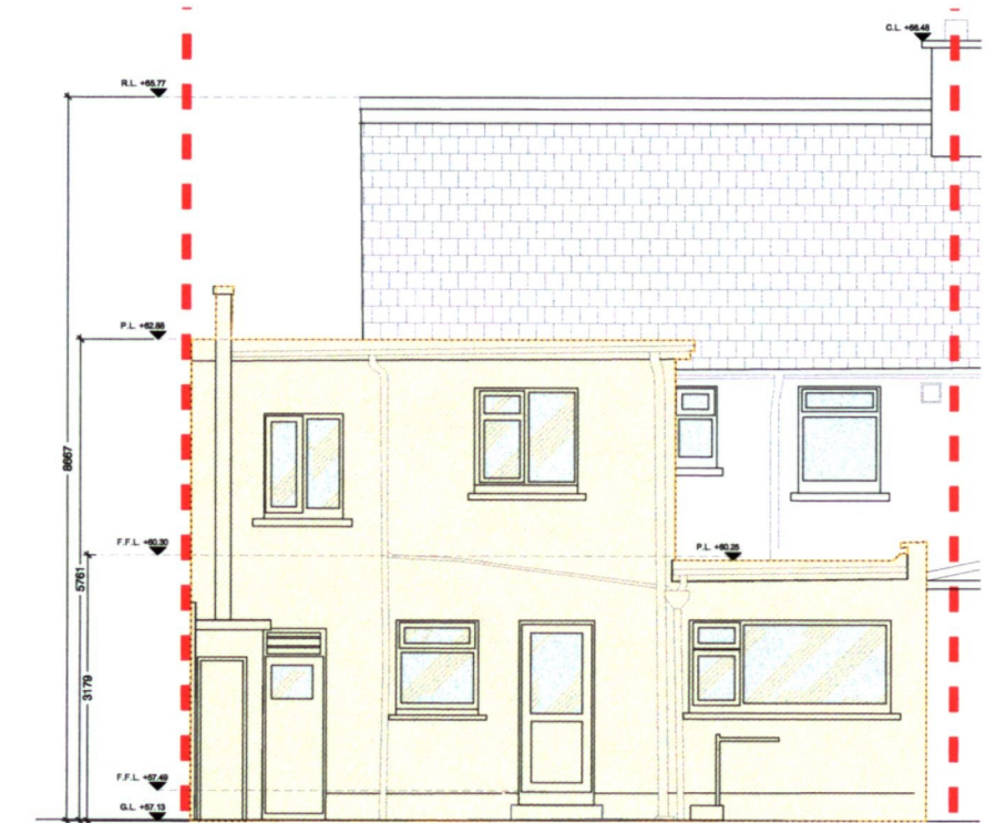
REAR ELEVATION scale 1.100