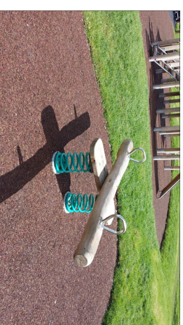
Tiger much to base of outdoor gym and formal playground equipment

Note 1: All play equipment to conform to EN 1176-4-11 and 1177 Playground Equipment and surfacing Note 2: Surface finished with engineered woodchip conforming to BS EN 1177 Impact attenuating surfacing