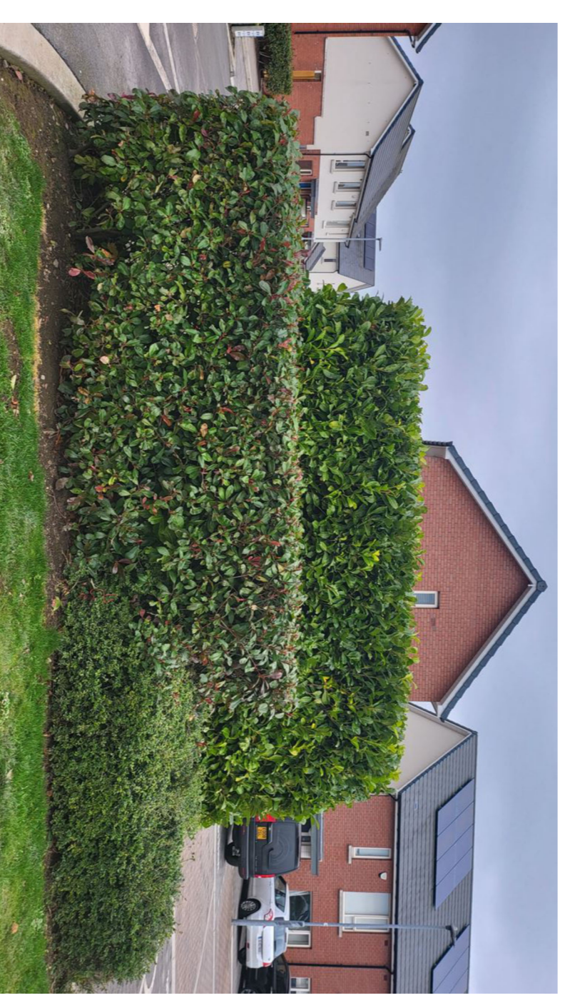
Side Elevation, screen planting to ESB Substation Straton Drive Adamstown