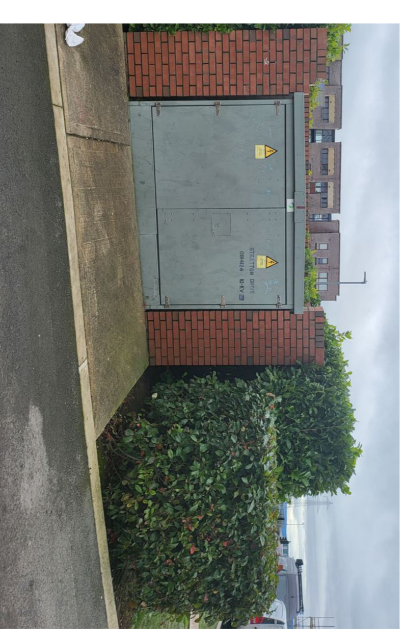
Side Elevation, screen planting to ESB Substation Straton Drive Adamstown