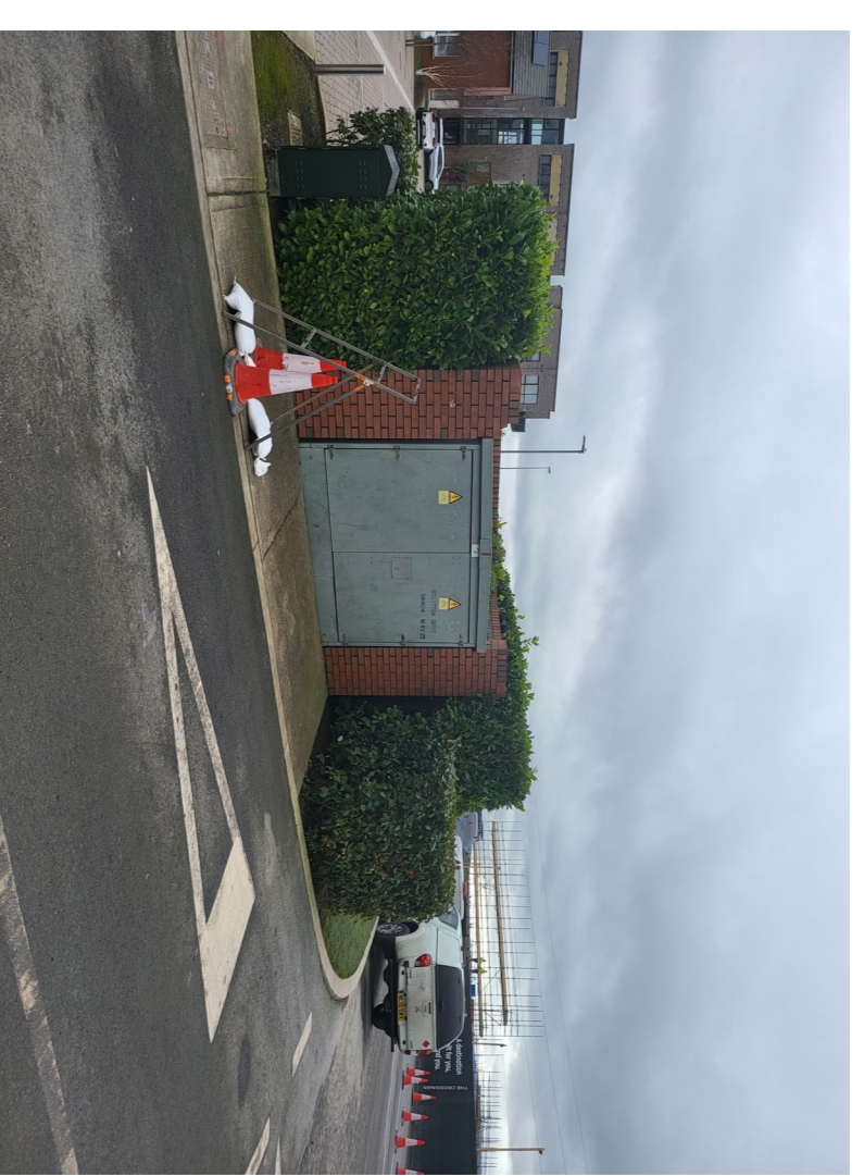
Front Elevation, screen planting to ESB Substation Straton Drive Adamstown