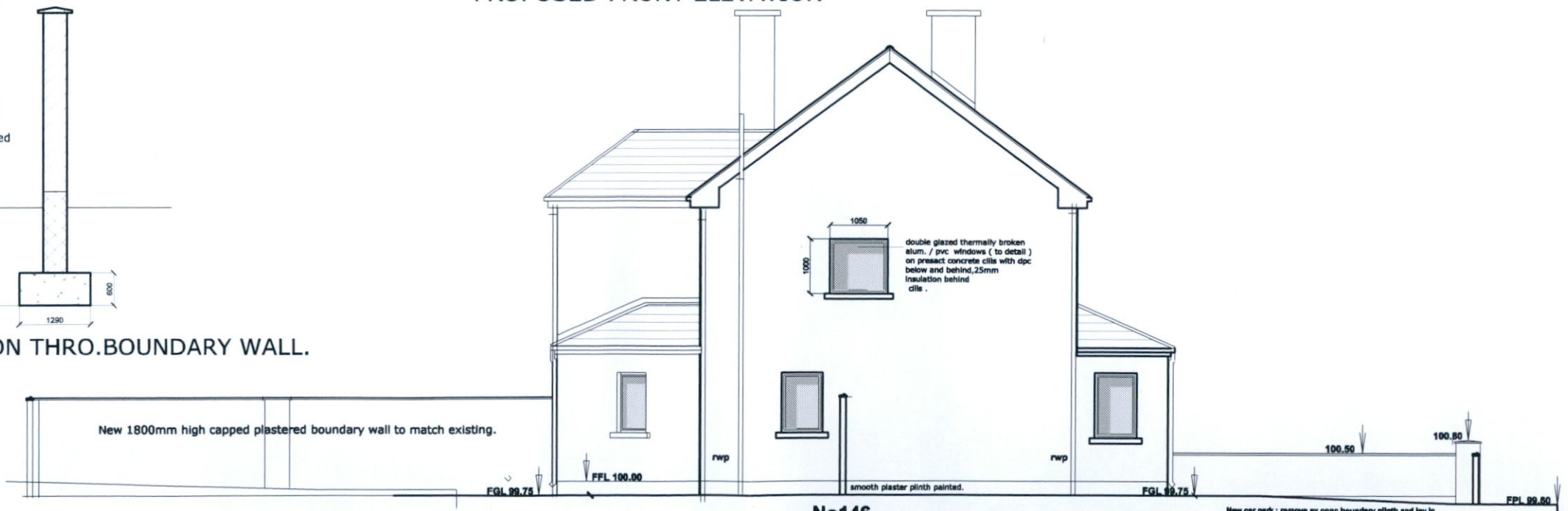
PROPOSED GABLE ELEVATION