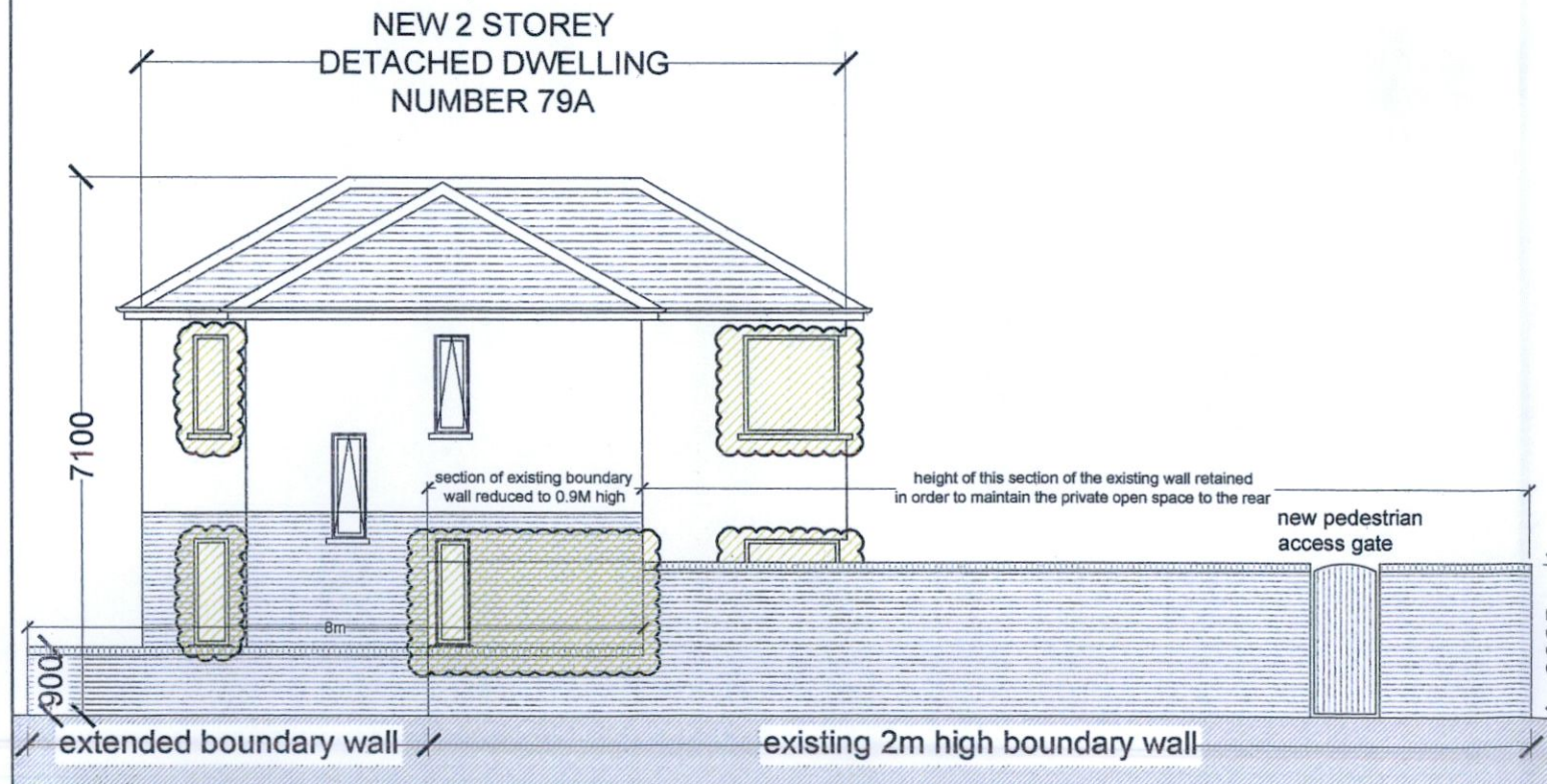
NORTHERN SIDE ELEVATION, FROM MOY GLAS VIEW @ 1:100