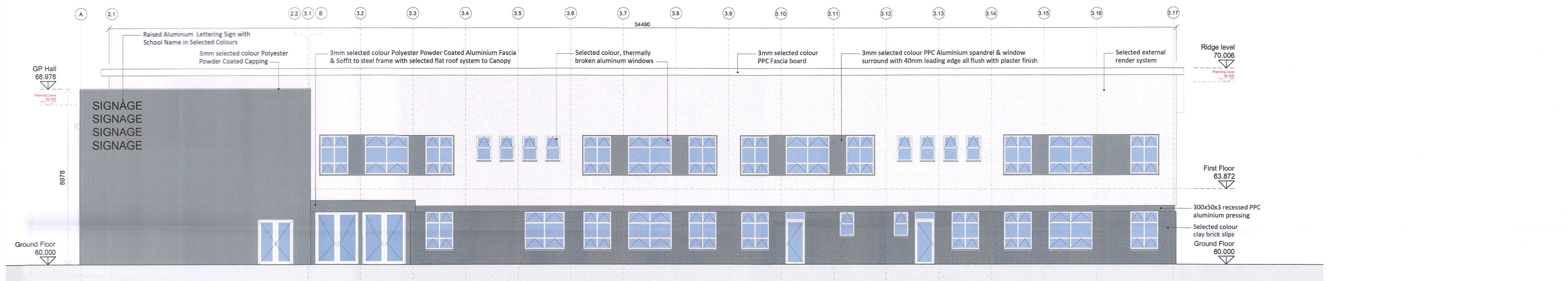
2 PROPOSED SOUTH ELEVATION 1:100 @ A1