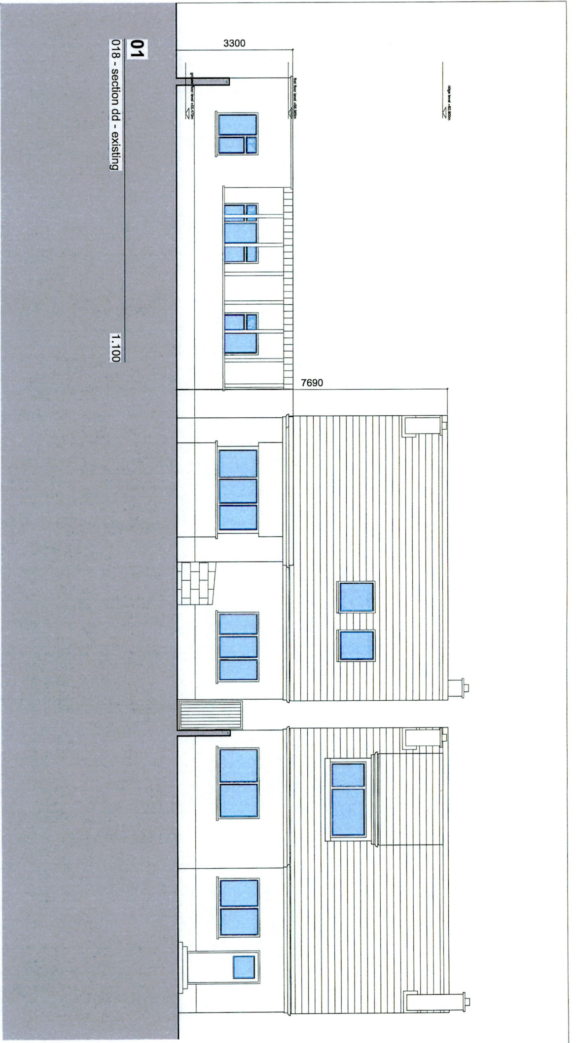
01 018 - section dd - existing 1:100