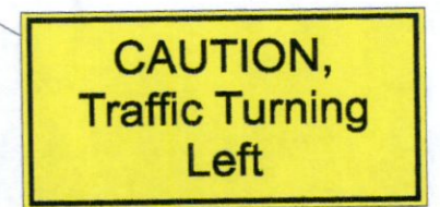
'Caution, Traffic Turning Left' Sign

Note* Blue Arrow = Vehicle with right of way Red Arrow = Vehicle to proceed after blue arrow vehicle