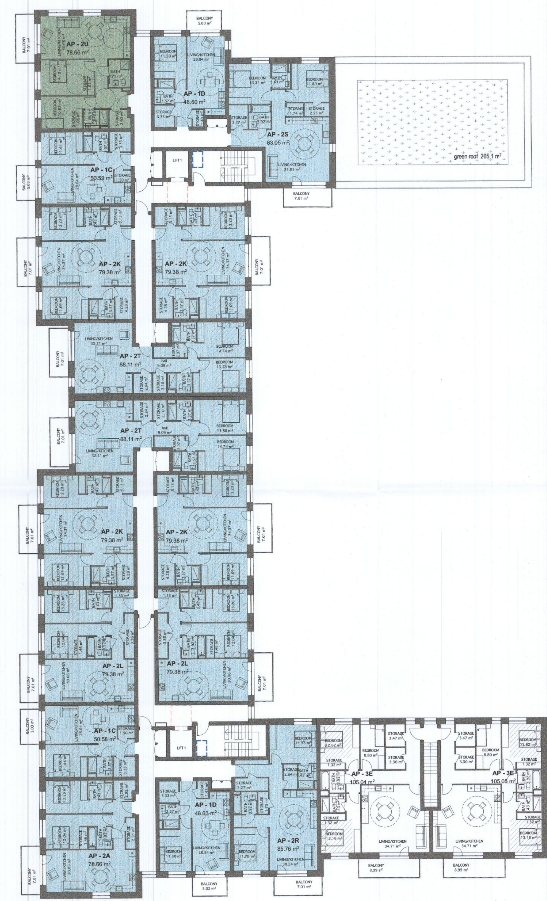
First Floor PART V 1:200