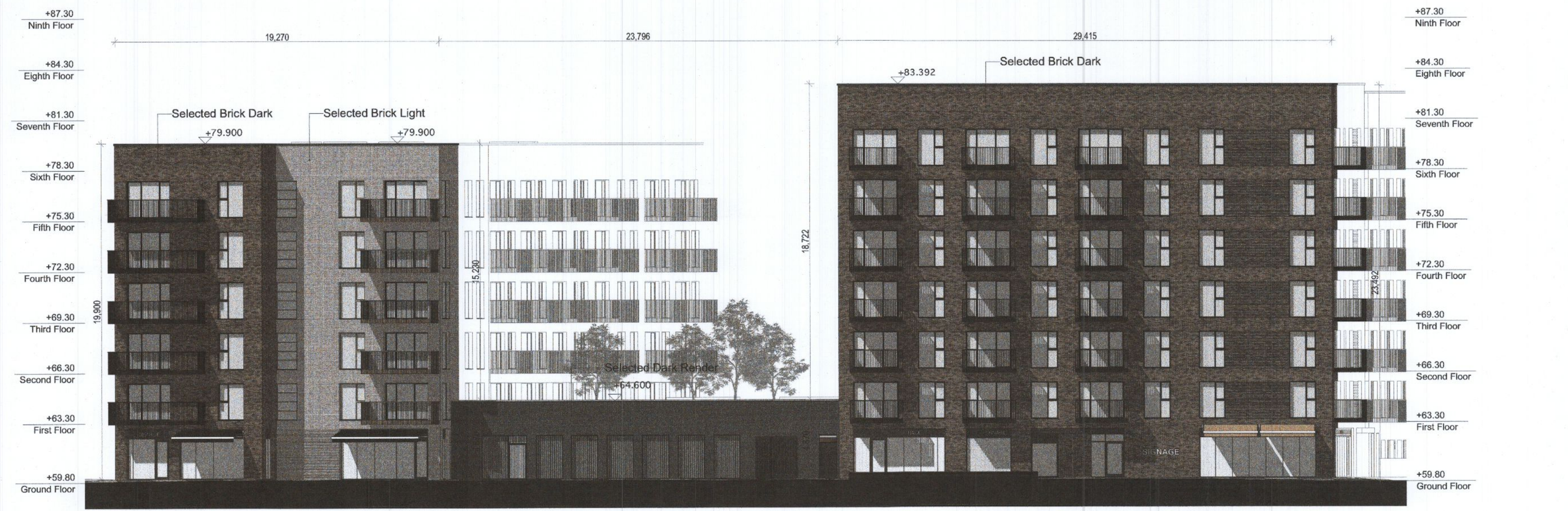
Elevation South SCALE:1:200