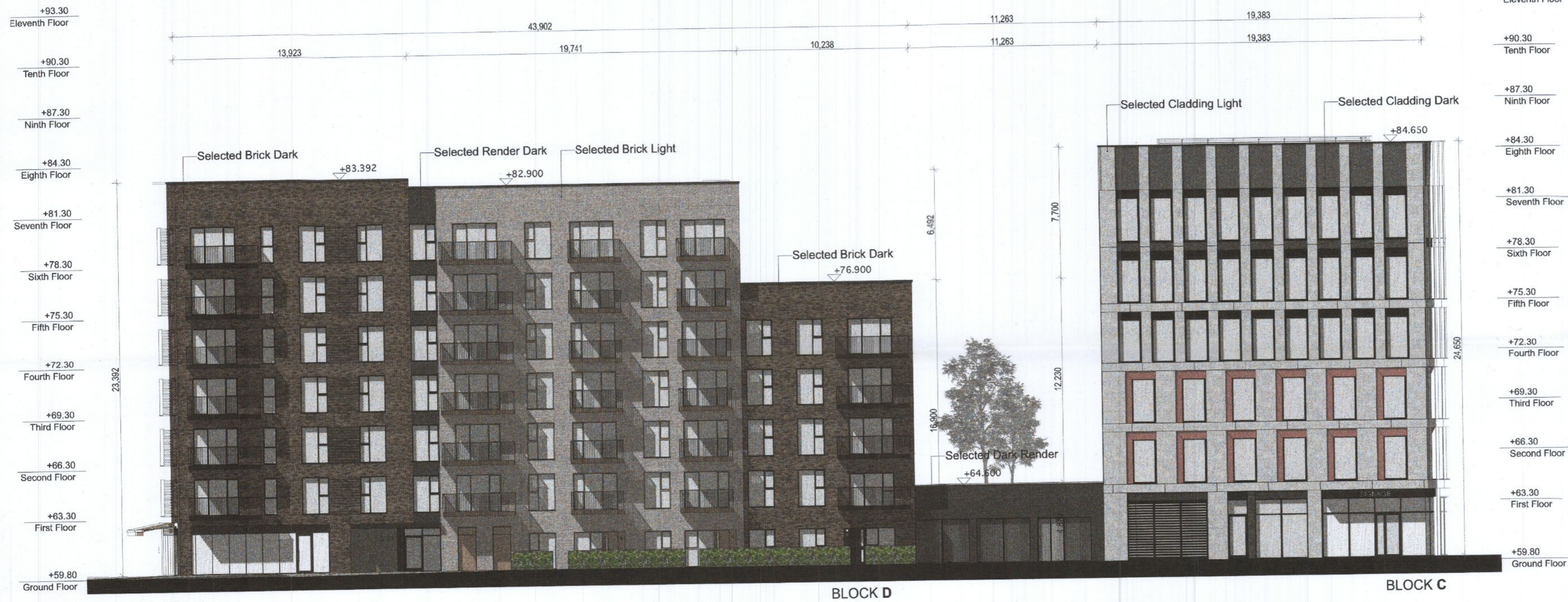
Elevation East SCALE:1:200