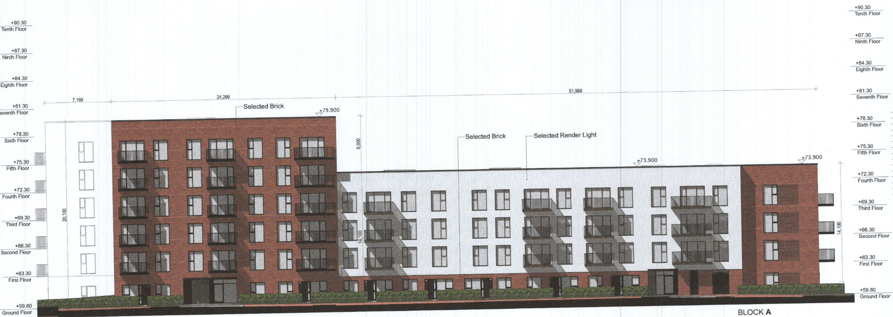
Elevation West SCALE:1:200