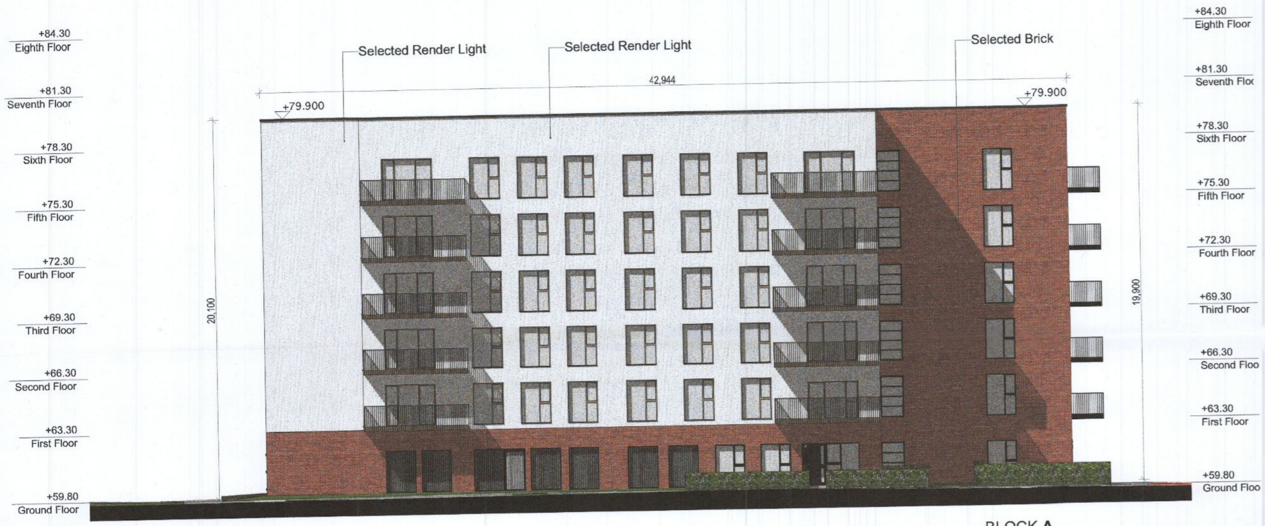
Elevation North SCALE:1:200