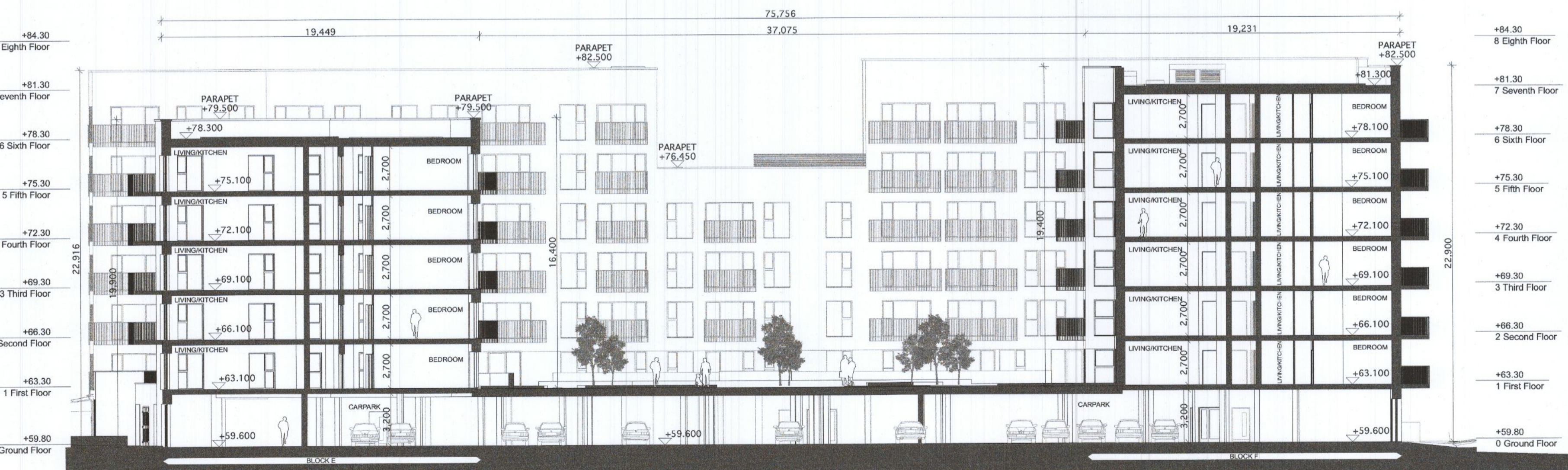
Section EF2 SCALE:1:200