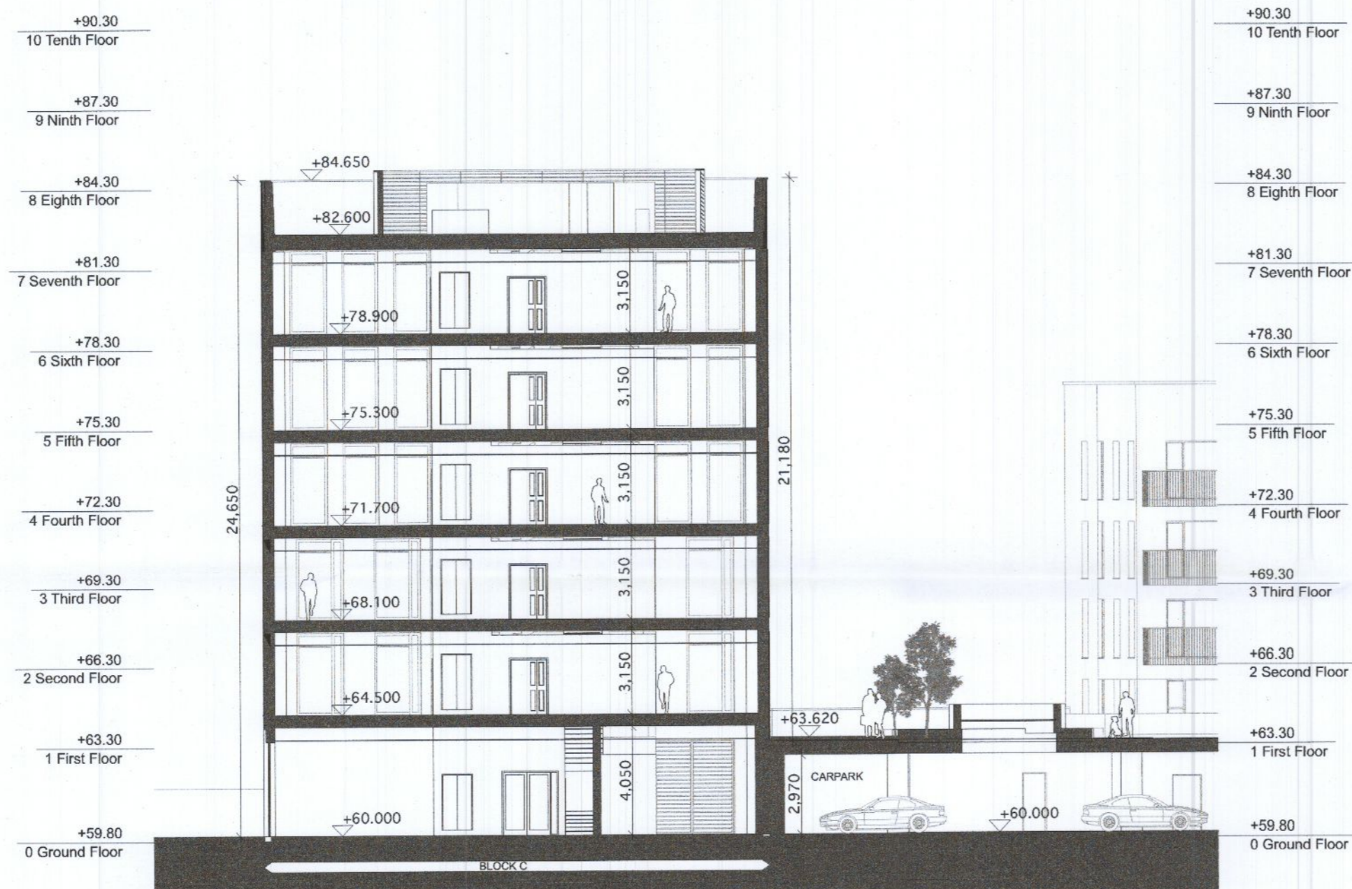
Section C1 SCALE:1:200