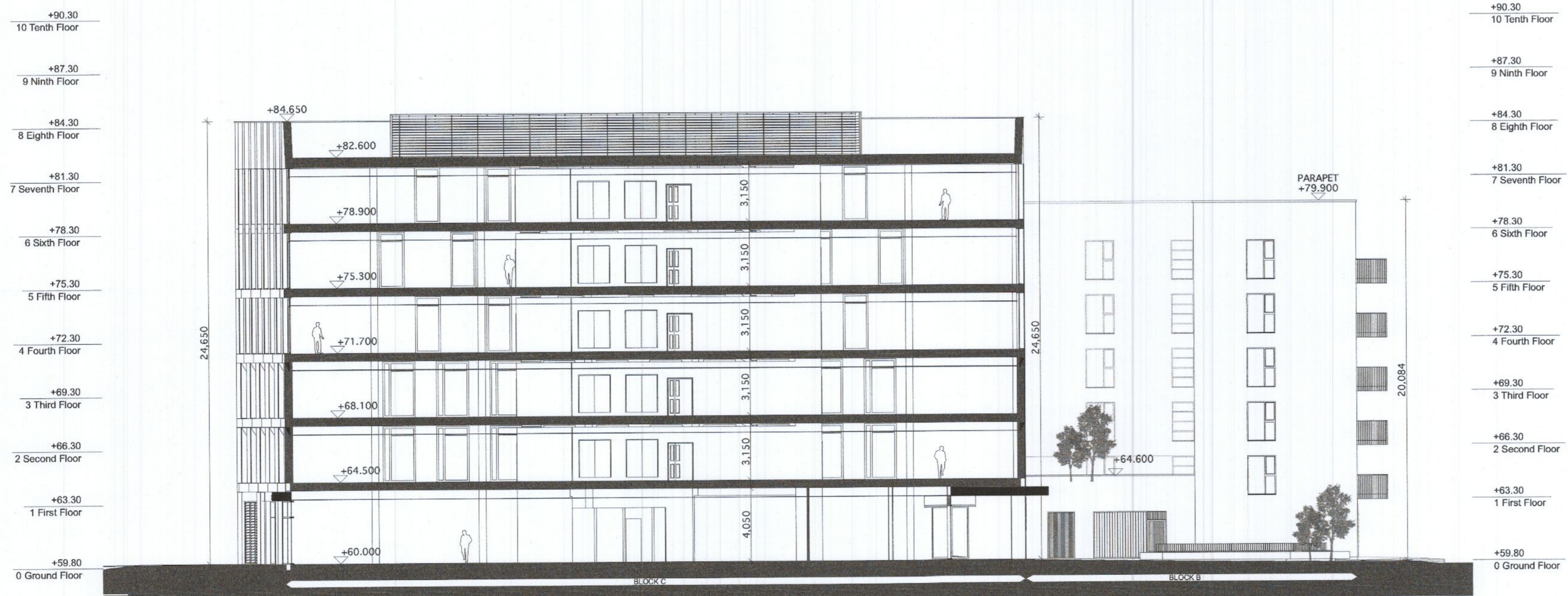
Section C2 SCALE:1:200