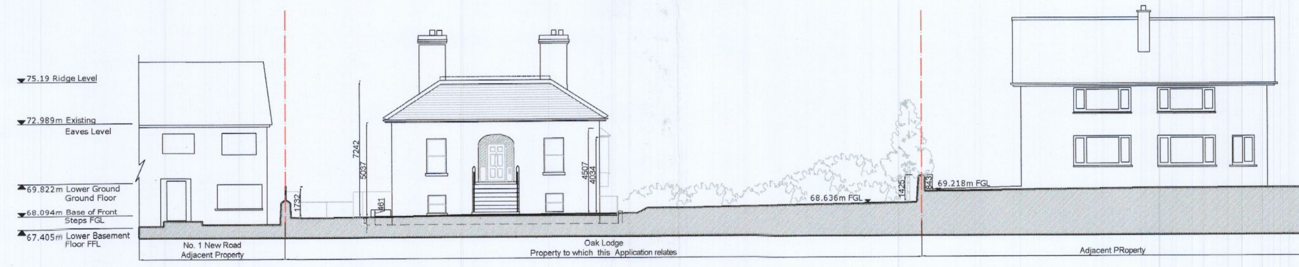
EXISTING WEST (FRONT) ELEVATION