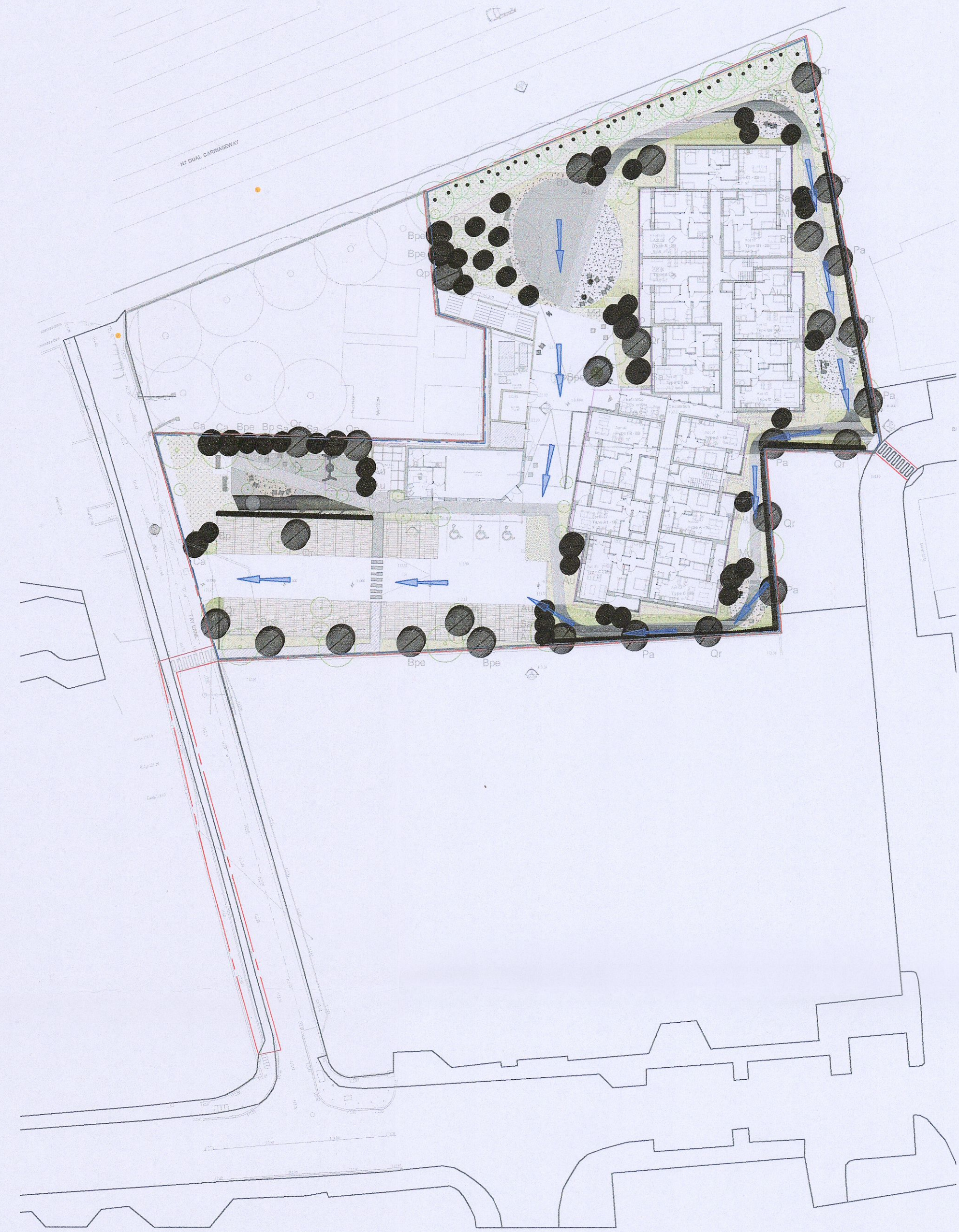
1 PROPOSED SITE FLOW PATHS SCALE 1:500