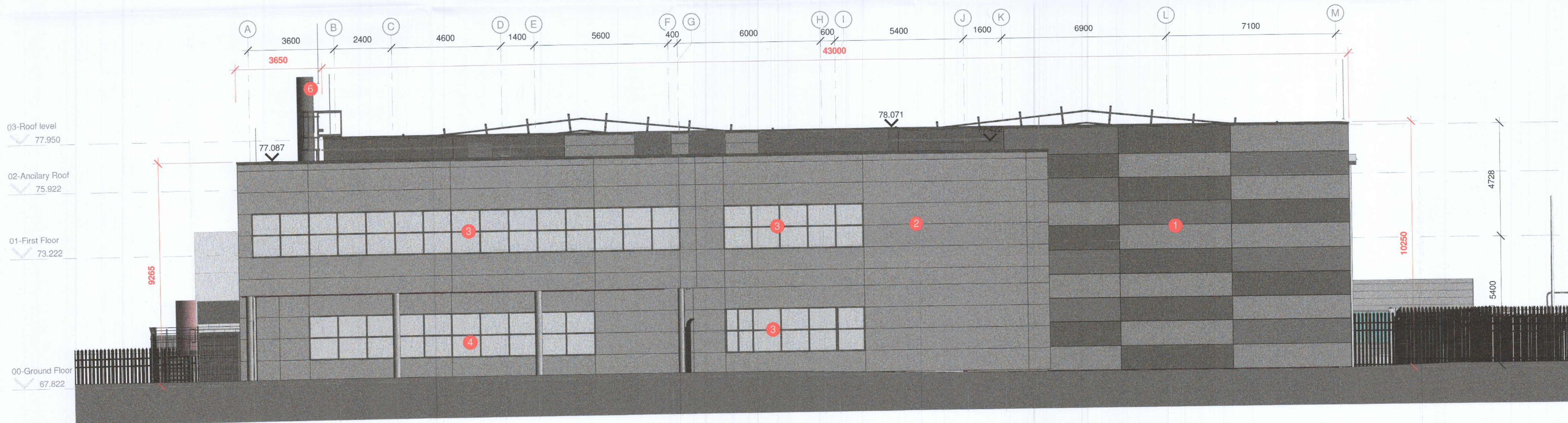
2 6509 Proposed West Elevation 1:100