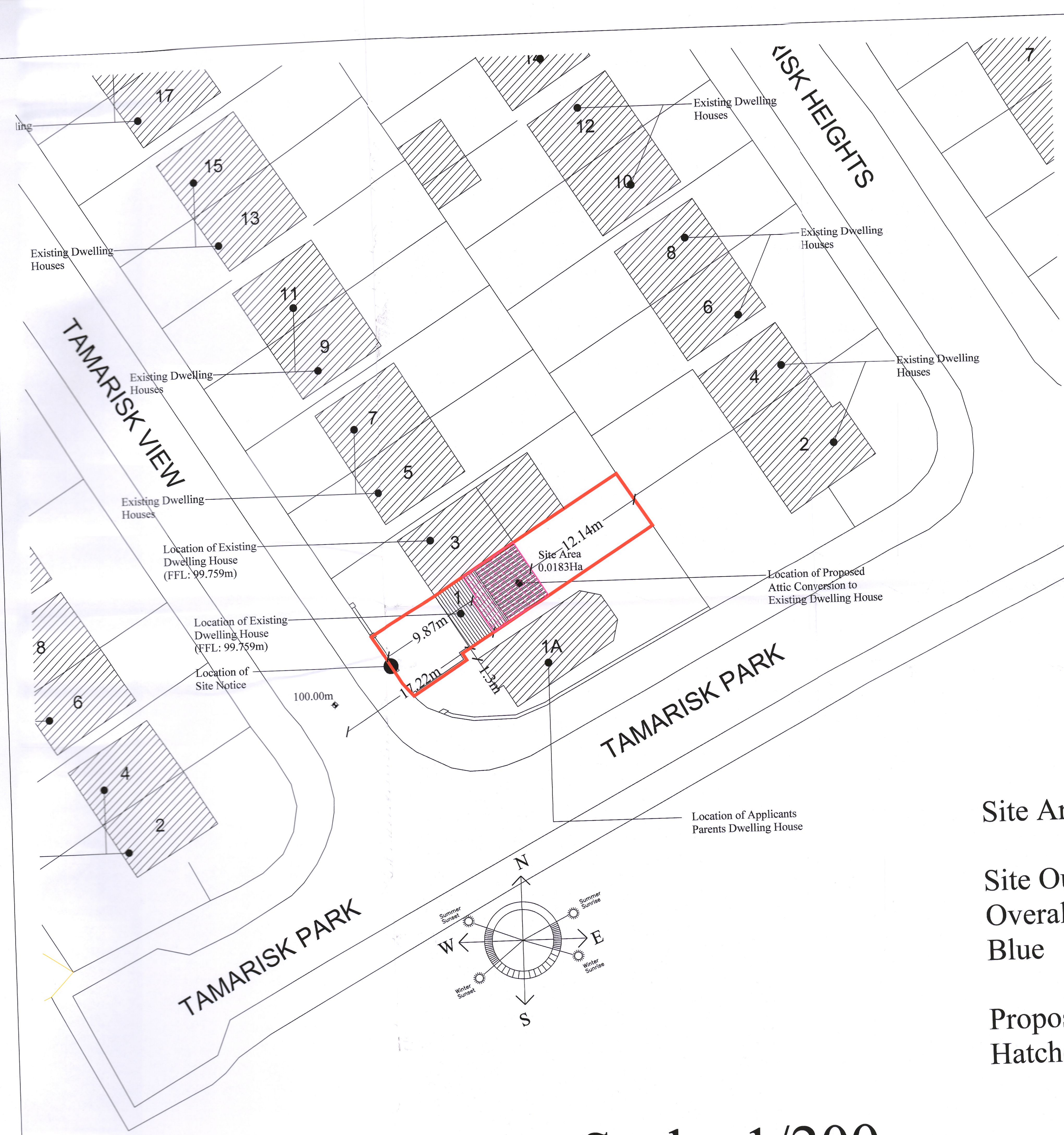
Site Layout Scale: 1/200