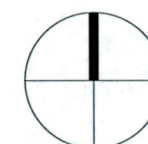
Key Plan - NTS