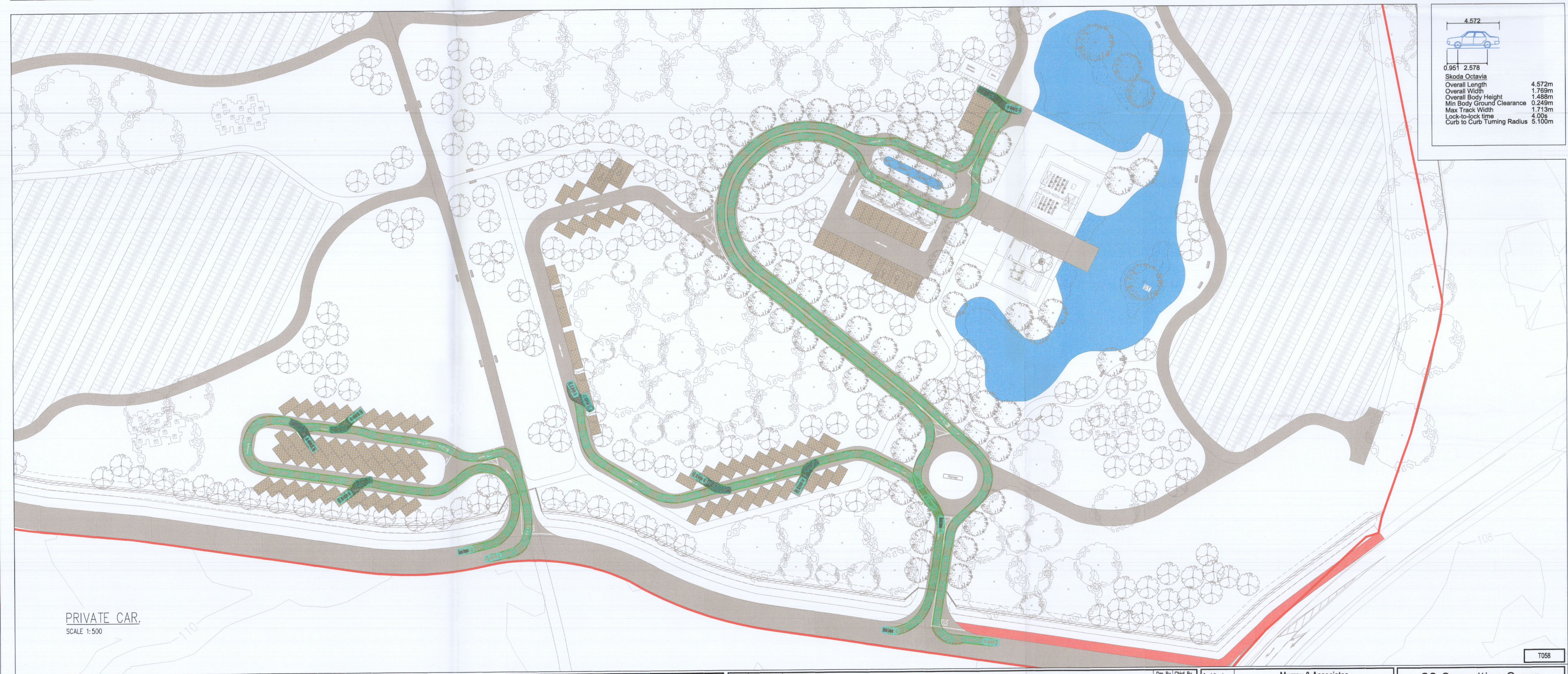
PRIVATE CAR SCALE 1:500

PLANNING DRAWING. NOT FOR CONSTRUCTION. ALL LEVELS GIVEN ARE RELATIVE TO ORDNANCE DATUM. THIS DRAWING HAS BEEN ISSUED FOR INFORMATION PURPOSES ONLY AND MUST NOT BE USED FOR CONSTRUCTION UNDER ANY CIRCUMSTANCES