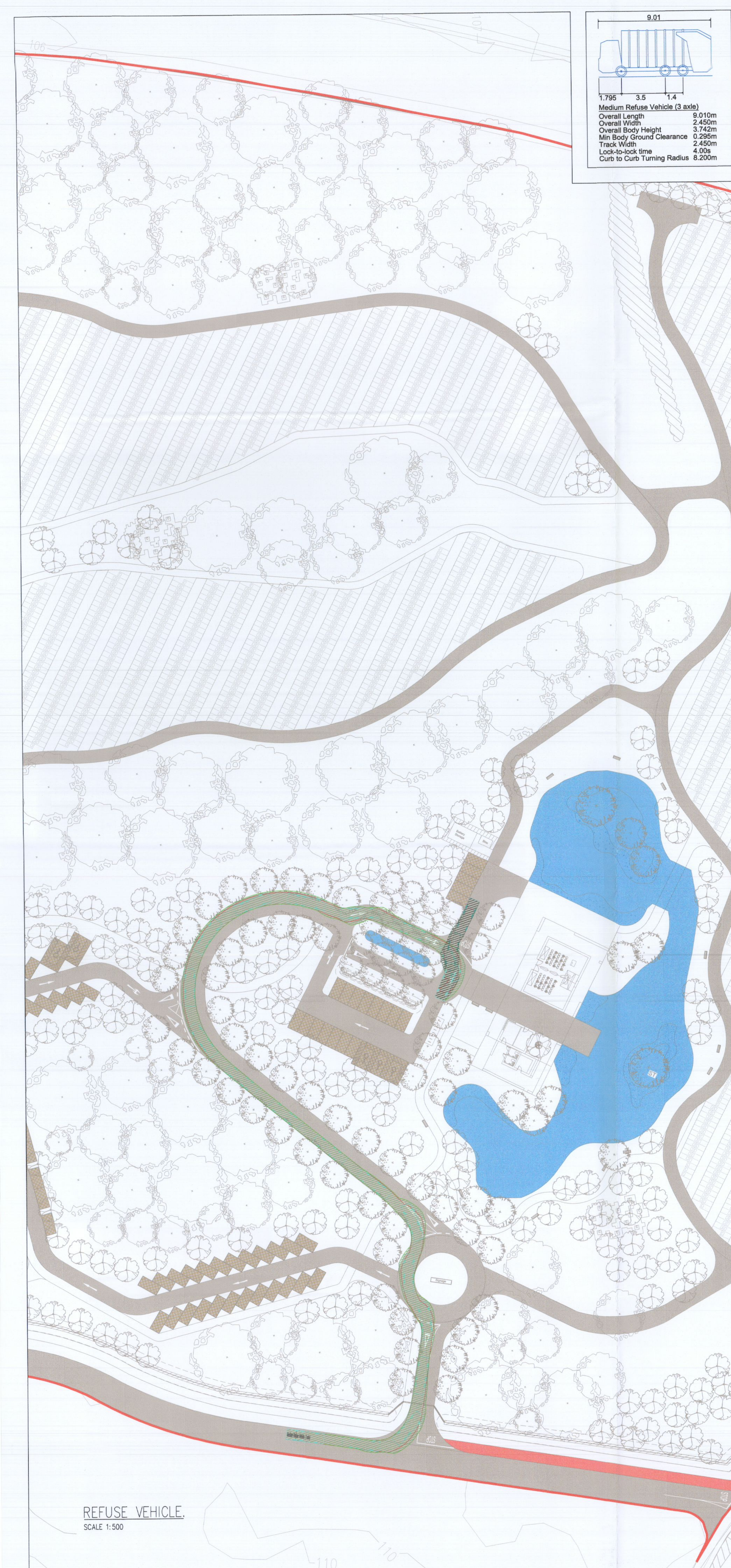
REFUSE VEHICLE SCALE 1:500