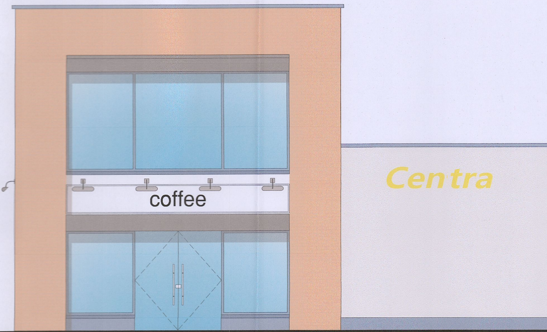
Proposed Coffee Shop Elevation (South) 1:50