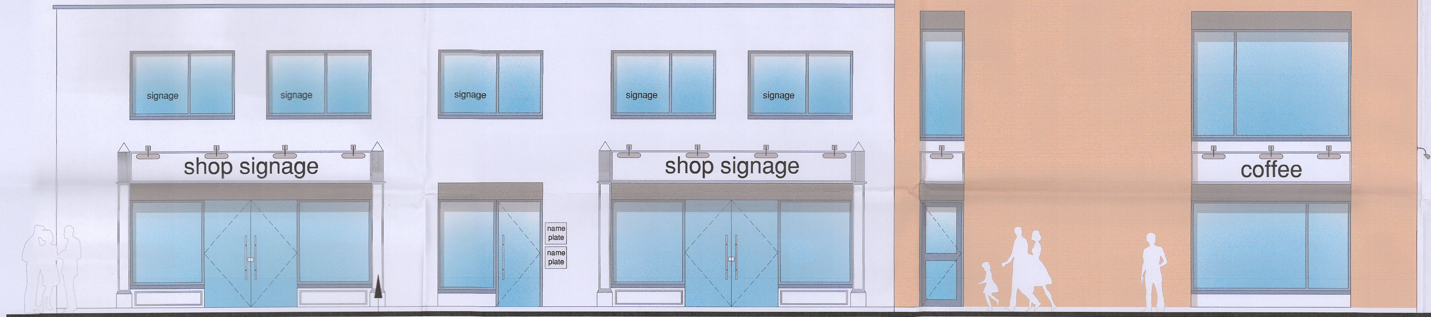
Proposed Coffee & Commercial Units Elevation (West) 1:50