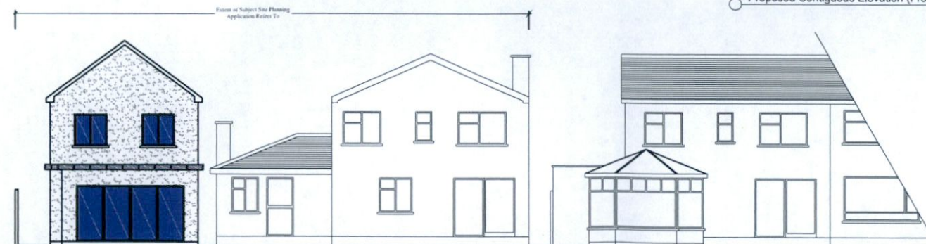
Proposed Contiguous Elevation (Rear)