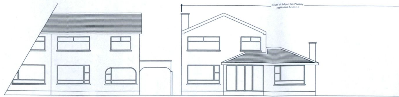
Existing Contiguous Elevation (Front)