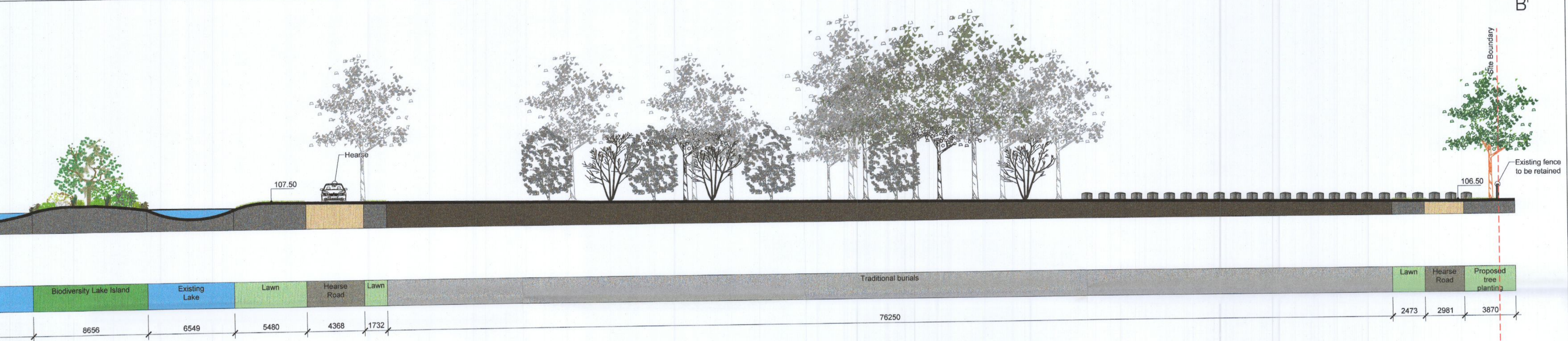
SECTION BB' - Scale 1:200