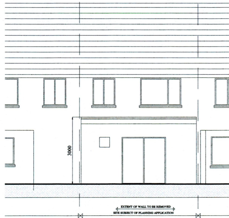
Elevation of Rear Extension to Garden