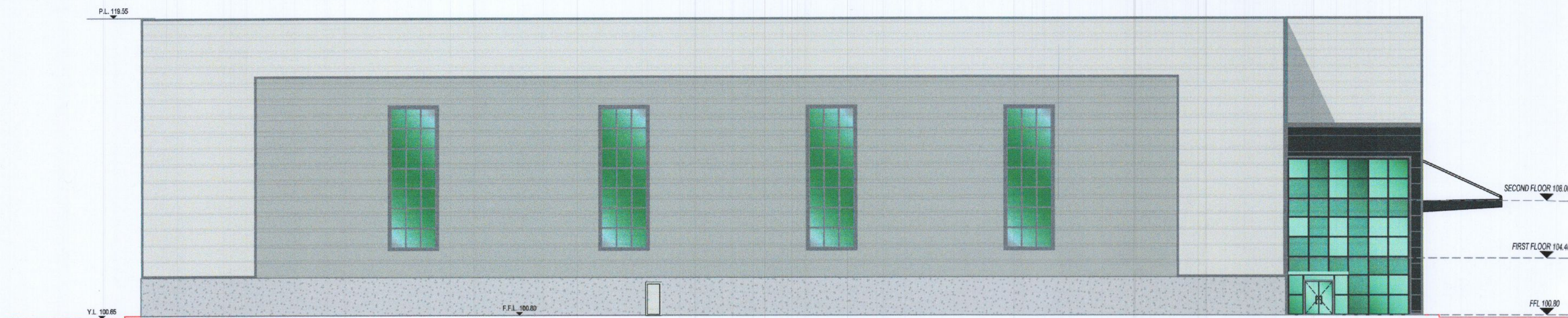
SIDE (EASTERN) ELEVATION scale 1:200