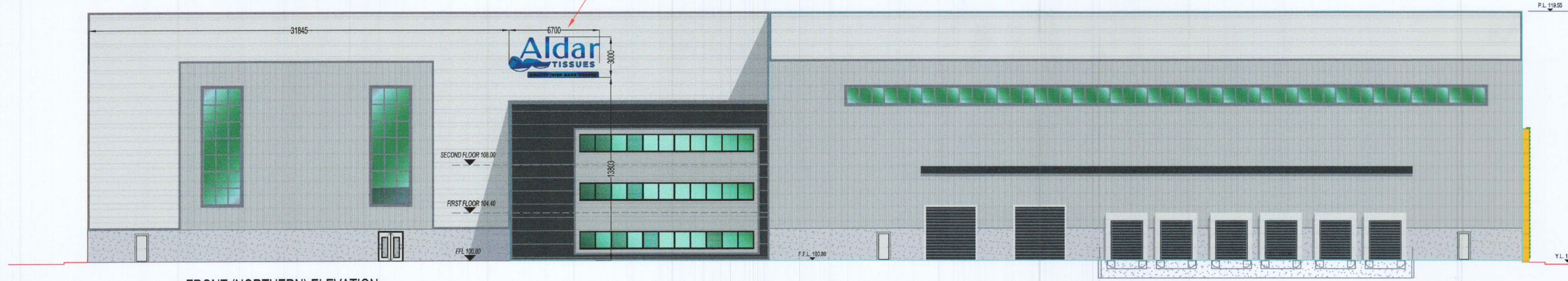
FRONT (NORTHERN) ELEVATION scale 1:200

POSITION OF PROPOSED SIGNAGE, SEE DRAWING 104P FOR DETAILS