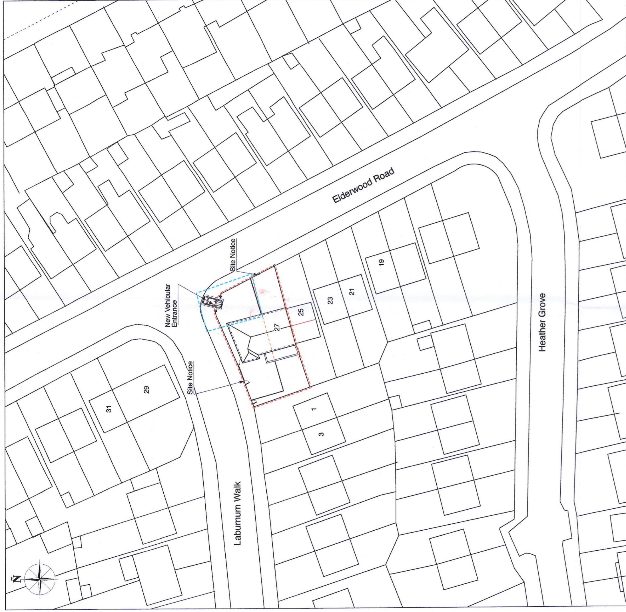
Site Layout Plan scale 1:500