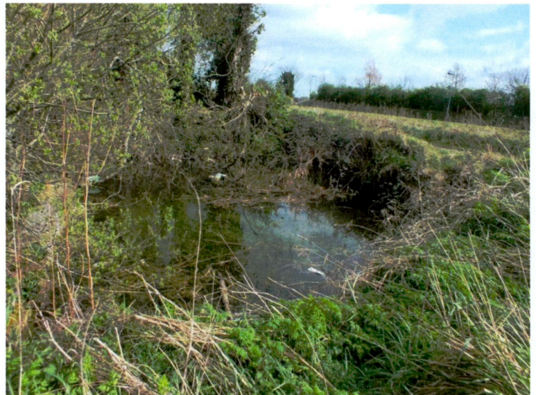
Plate 21 (below). Run-off drain and pool from Grand Canal, at south-east of the survey area [August 2020].