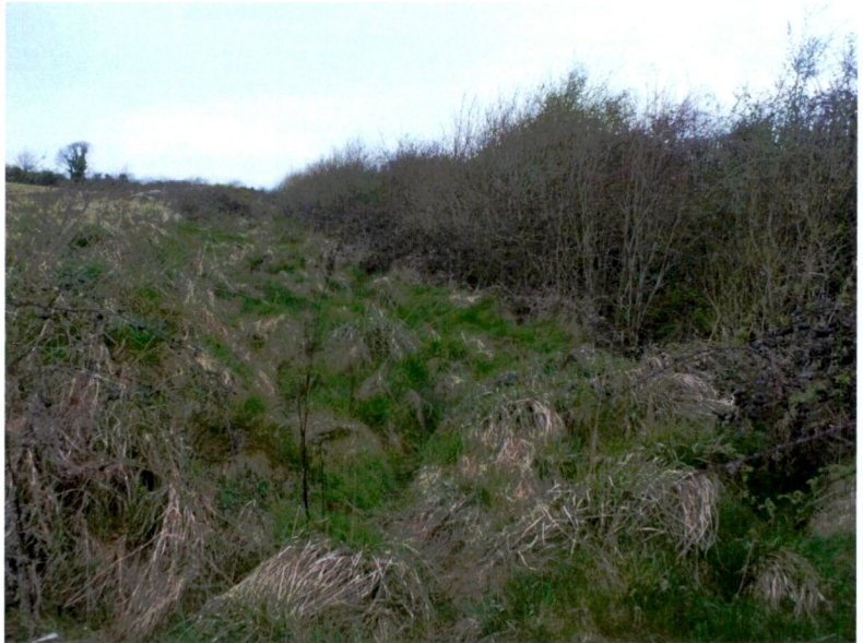
Plate 11. One of the larger pools that has within the survey area [March 2021].