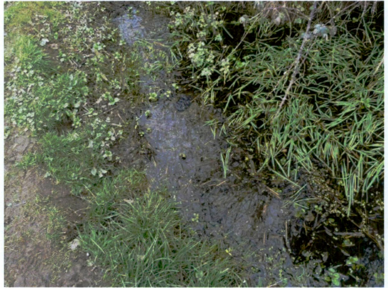
Plate 14. One of the larger pools that had formed along wet ditches and drains in the survey area. Frog spawn was present at this pool in March 2021.