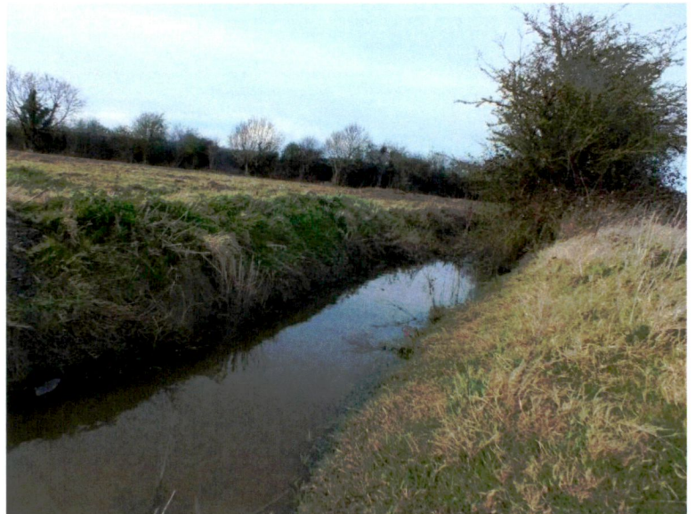
Plate 18. Hedgerow and treeline adjacent to the Canal towpath at the south-east of the survey area. Some of the scrub had been cleared. [March 2021].