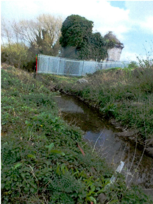
Plate 20. Drainage channel at south-east (as above), with disused building alongside the Canal. View to east.