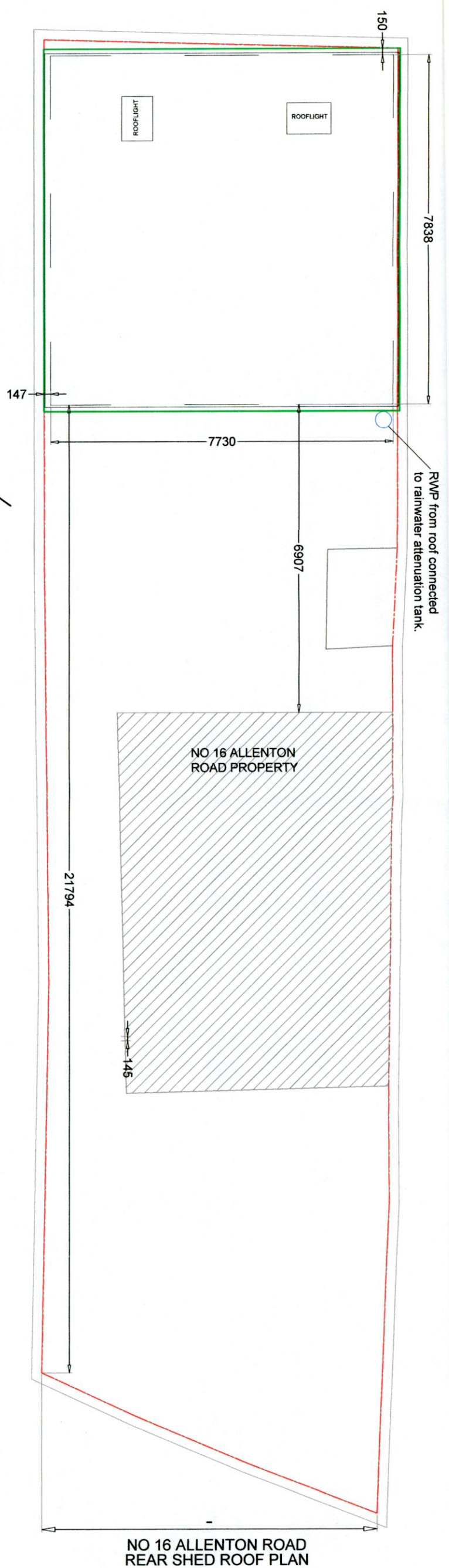
NO 16 ALLENTON ROAD REAR SHED ROOF PLAN