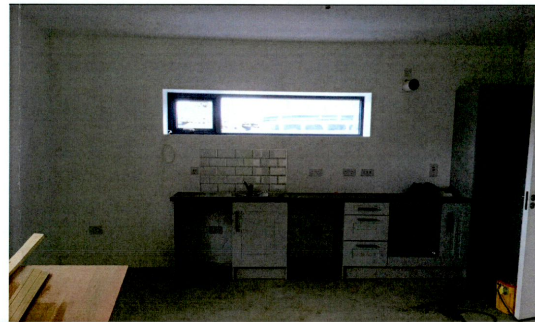
Photograph of Temple Court apartment kitchen showing high level north-facing window. NTS

Note: Internal dimensions in Temple Court apartments are approximate.