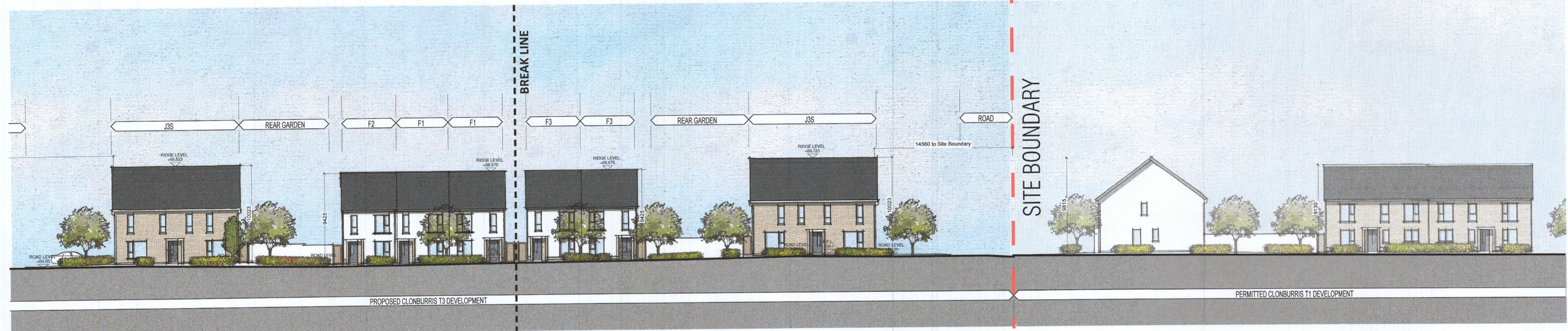
3 CONTIGUOUS ELEVATION G-G (cont.) 1:200@A1