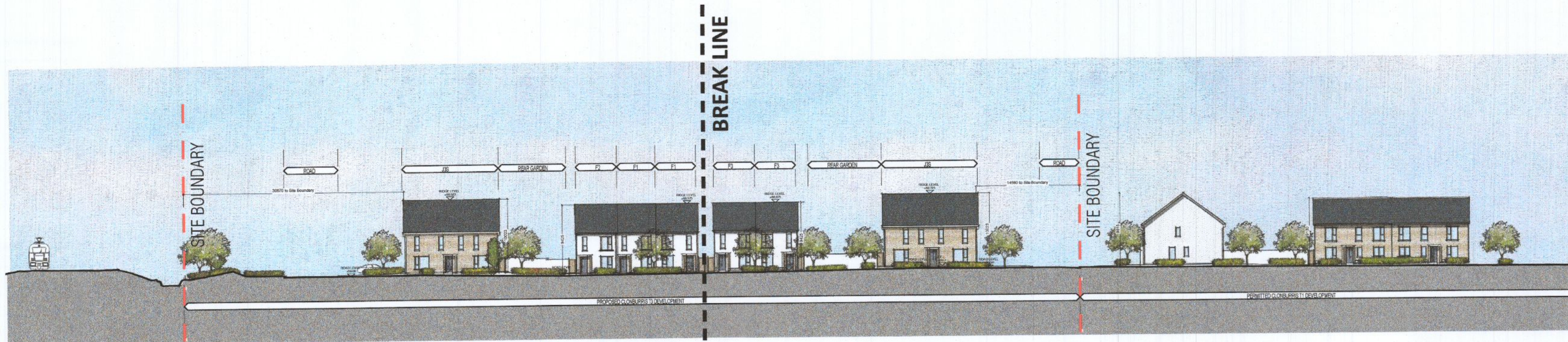
1 CONTIGUOUS ELEVATION G-G 1:500@A1