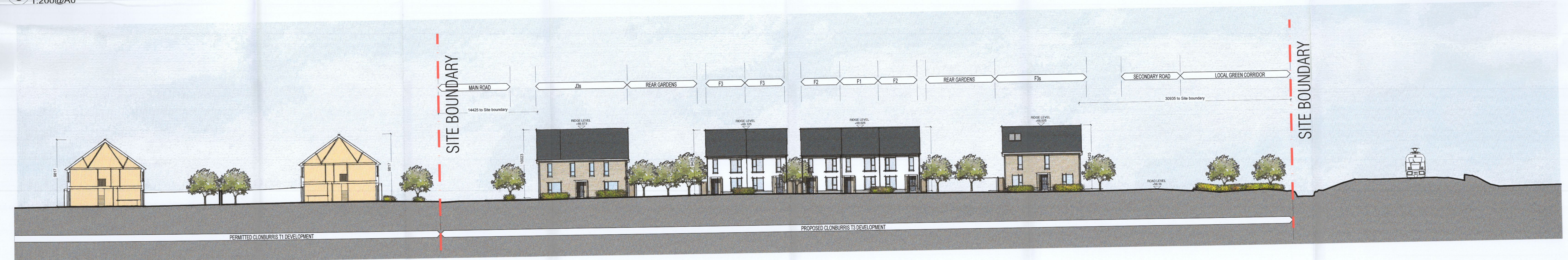
5 CONTIGUOUS ELEVATION F-F 1:200@A0