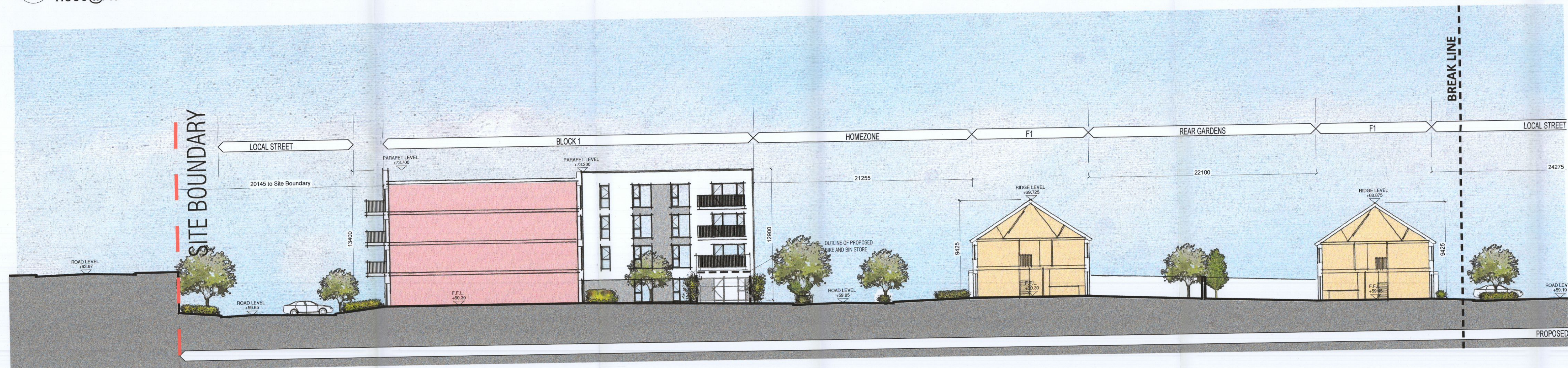
2 CONTIGUOUS ELEVATION E-E 1:200@A0