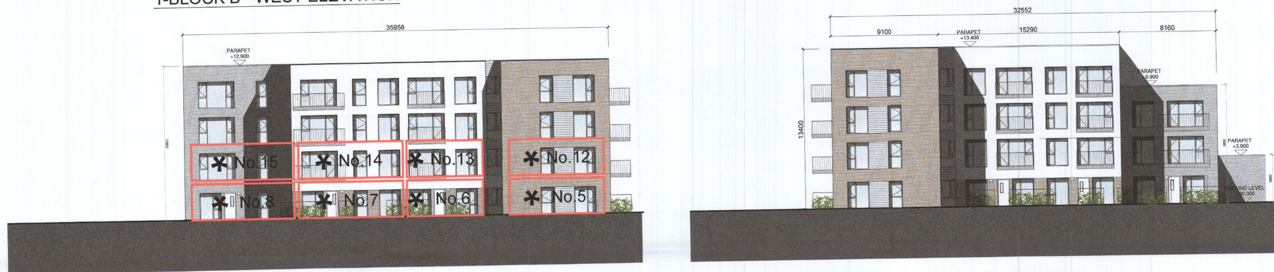
2-BLOCK 1 - NORTH ELEVATION