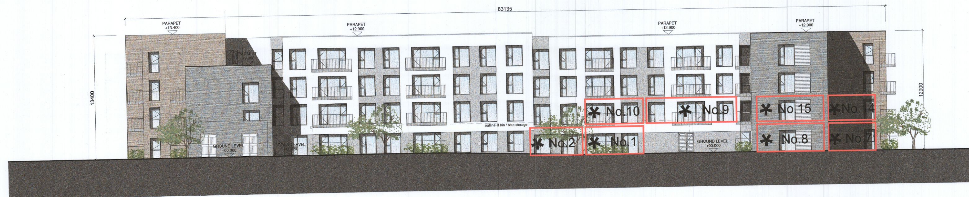
4-BLOCK 1 - EAST ELEVATION