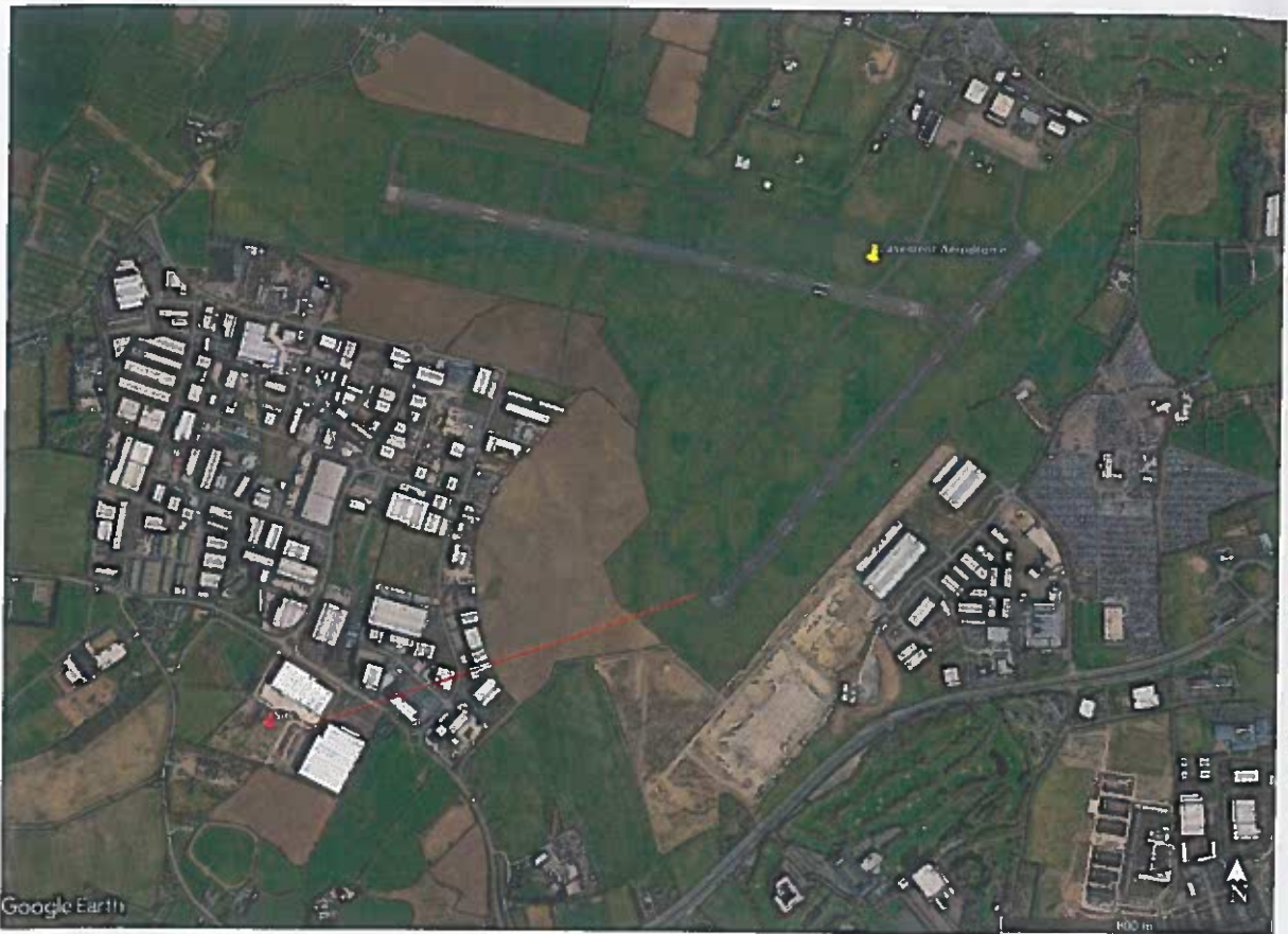
Figure 3: Aerial view (Google Earth Pro) showing the location of the PV panels (red pin) relative to Casement Aerodrome located to the northeast (yellow pin).

Casement Aerodrome is located approximately 1.2km to the northeast (heading of 70 degrees) of the proposed PV panels (Figure 3 refers) thus warrants inclusion in this assessment. There are four runway approaches at Casement Aerodrome; 10,28, 04 and 22. The Air Traffic Control Tower (ATCT) at Casement Aerodrome is 9m Above Ground Level (AGL) and will be referenced as '1-ATCT' in this report.