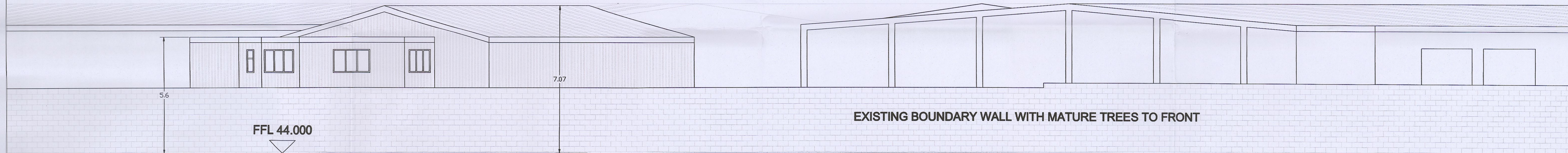
CONTIGUOUS ELEVATION ALONG CANAL SCALE 1:100 @ A1