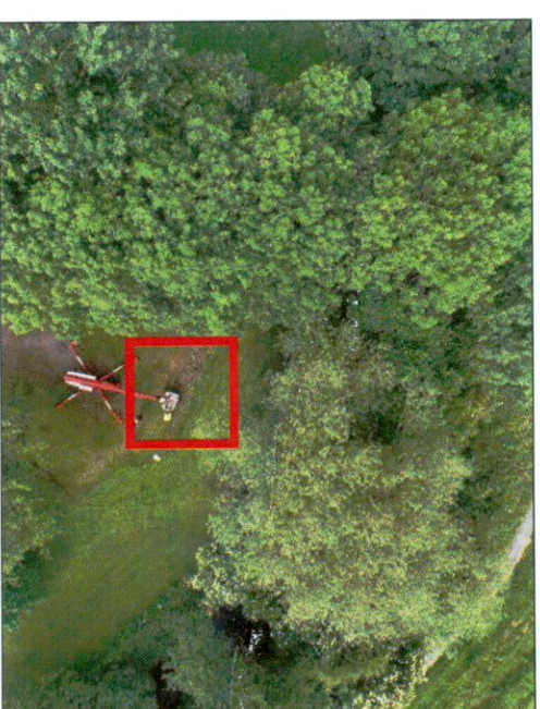
FIG. 2: PROPOSED SITE LOCATION