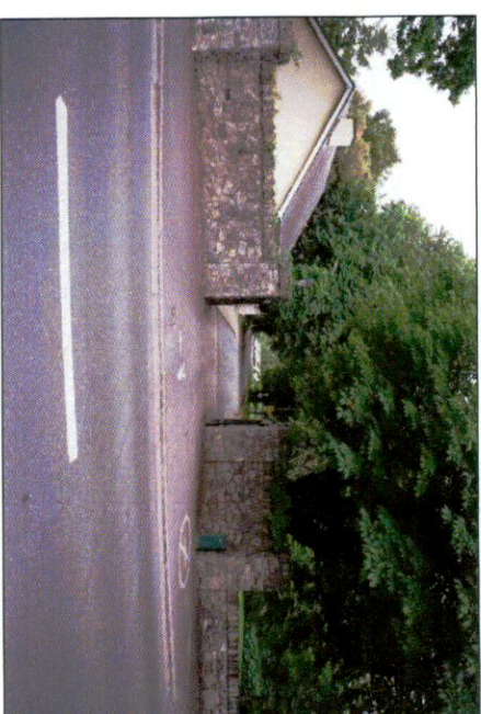
FIG. 1: EXISTING SITE ACCESS POINT