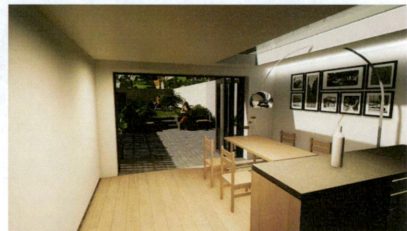
6 PROPOSED INTERNAL VIEW OF SKYLIGHT AND BIFOLD DOORS