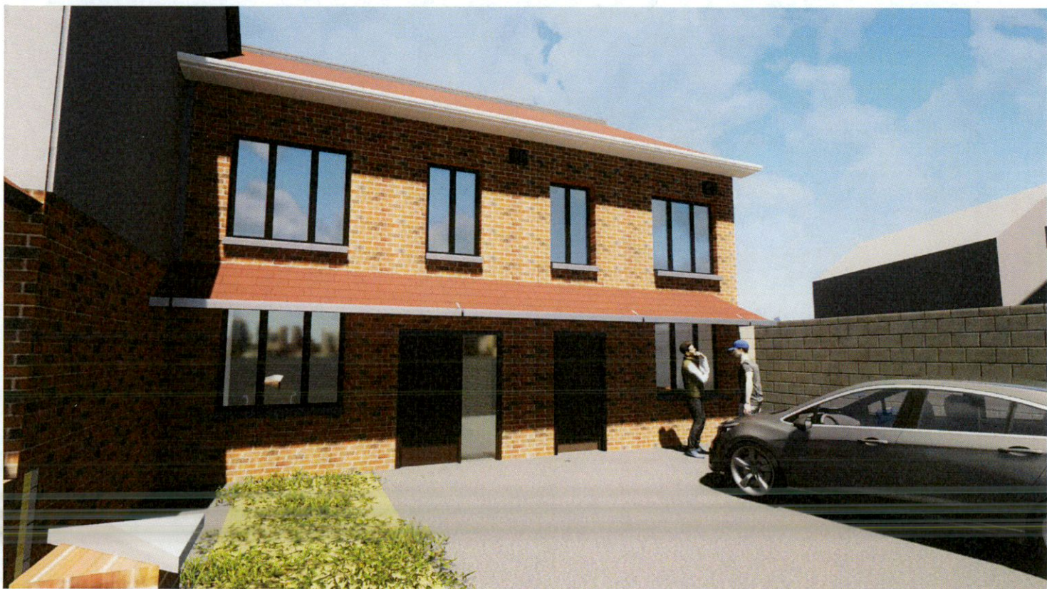
3 PROPOSED ENTRANCE VIEW OF NO.25 & 25A