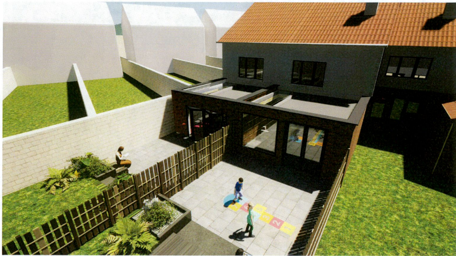
1 PROPOSED REAR GARDEN VIEW TOWARDS NO.25 & 25A