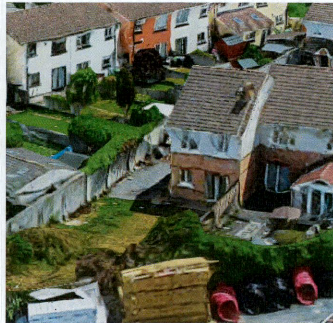
2 EXISTING AERIAL VIEW OF NO.25