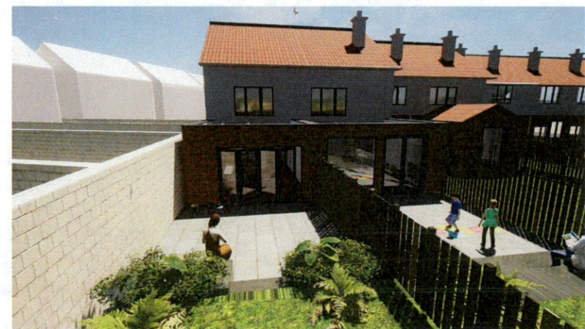
7 PROPOSED ADDITIONAL REAR GARDEN ROOF