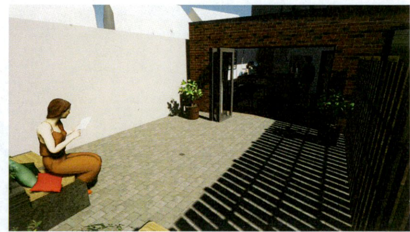
5 PROPOSED GARDEN VIEW TOWARDS REAR OF NO.25A