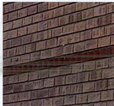
3 - Proposed Yellow Brick with Tan Brick Detail To Match Existing As Shown