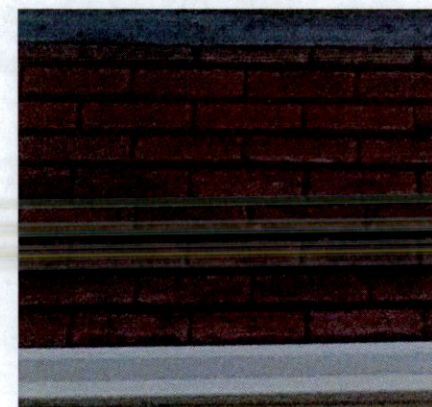
5 - Proposed front awning To Match Existing As Shown