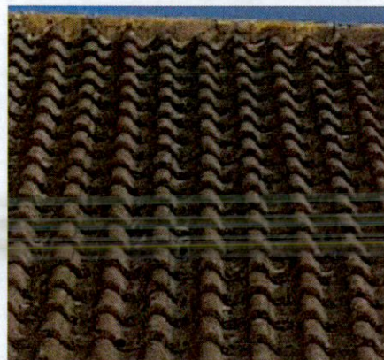
2 - Proposed Roof Tile To Match Existing As Shown