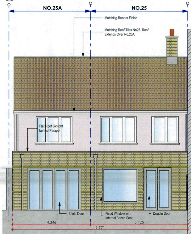
3.1 Proposed Rear/ Garden Elevation - No.25/25A 1:100