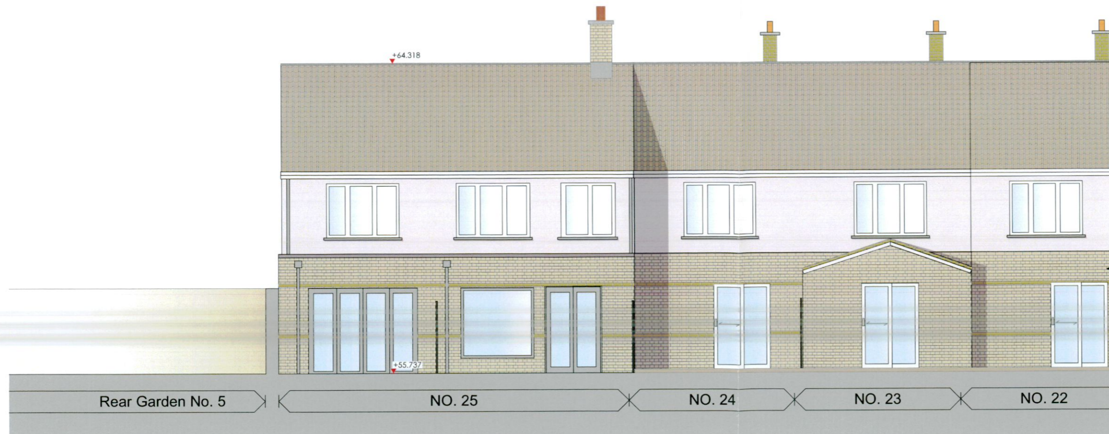
Proposed Contiguous Rear Garden Elevation - E2 1:100