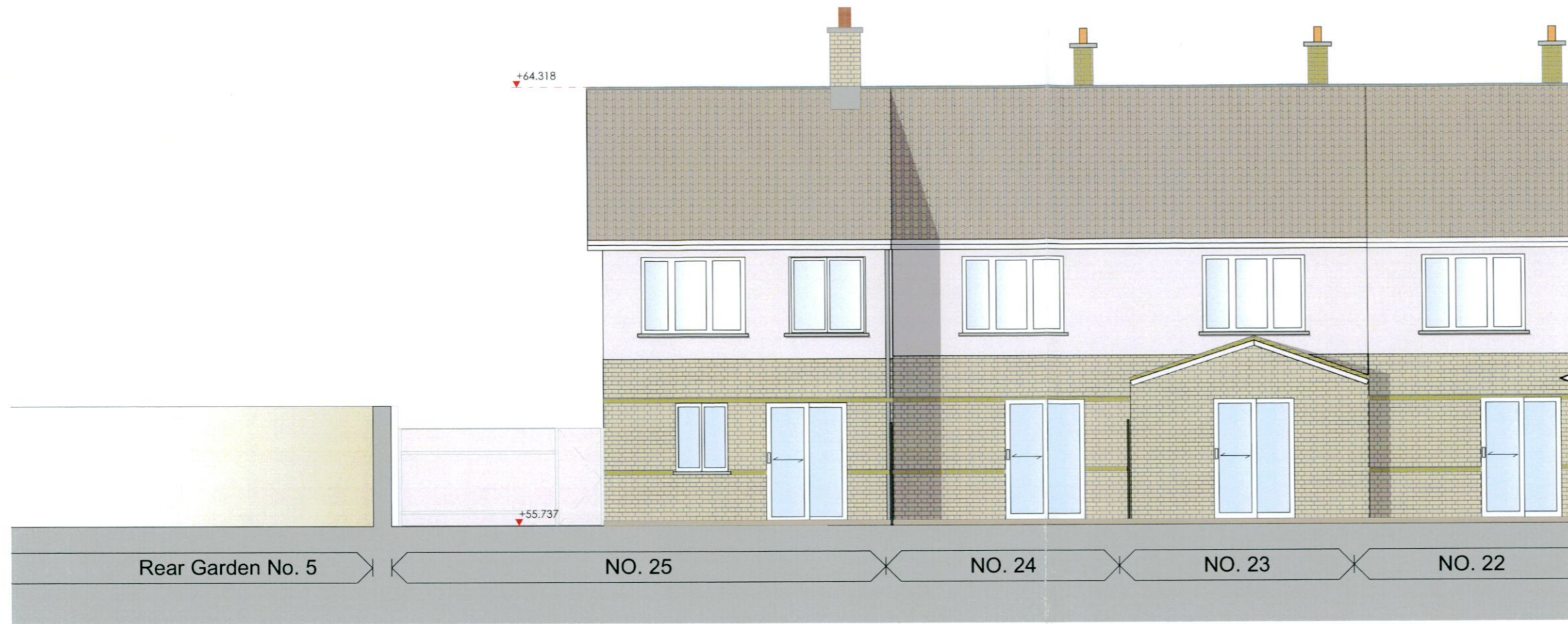
Existing Contiguous Rear Garden Elevation - E2 1:100