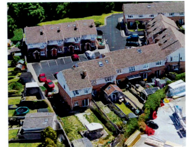
EXISTING REF IMAGE