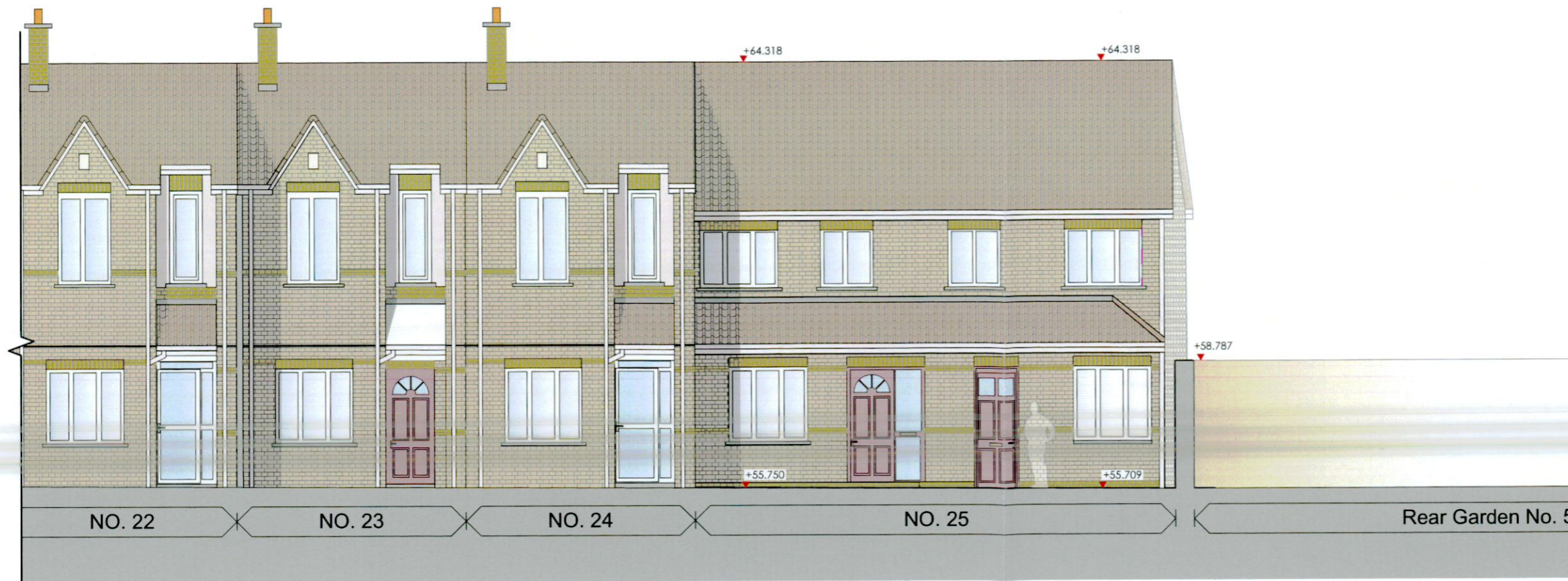
2 Proposed Contiguous Front Elevation - E1 1:100