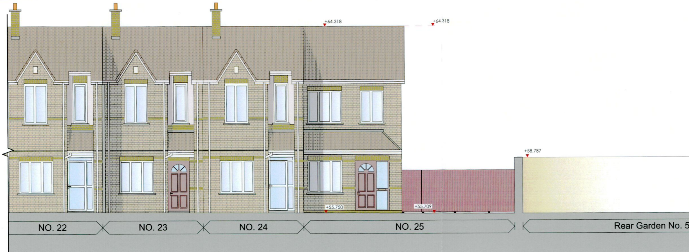
1 Existing Contiguous Front Elevation - E1 1:100