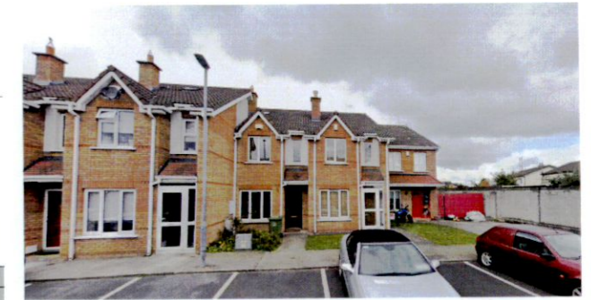
EXISTING REF IMAGE