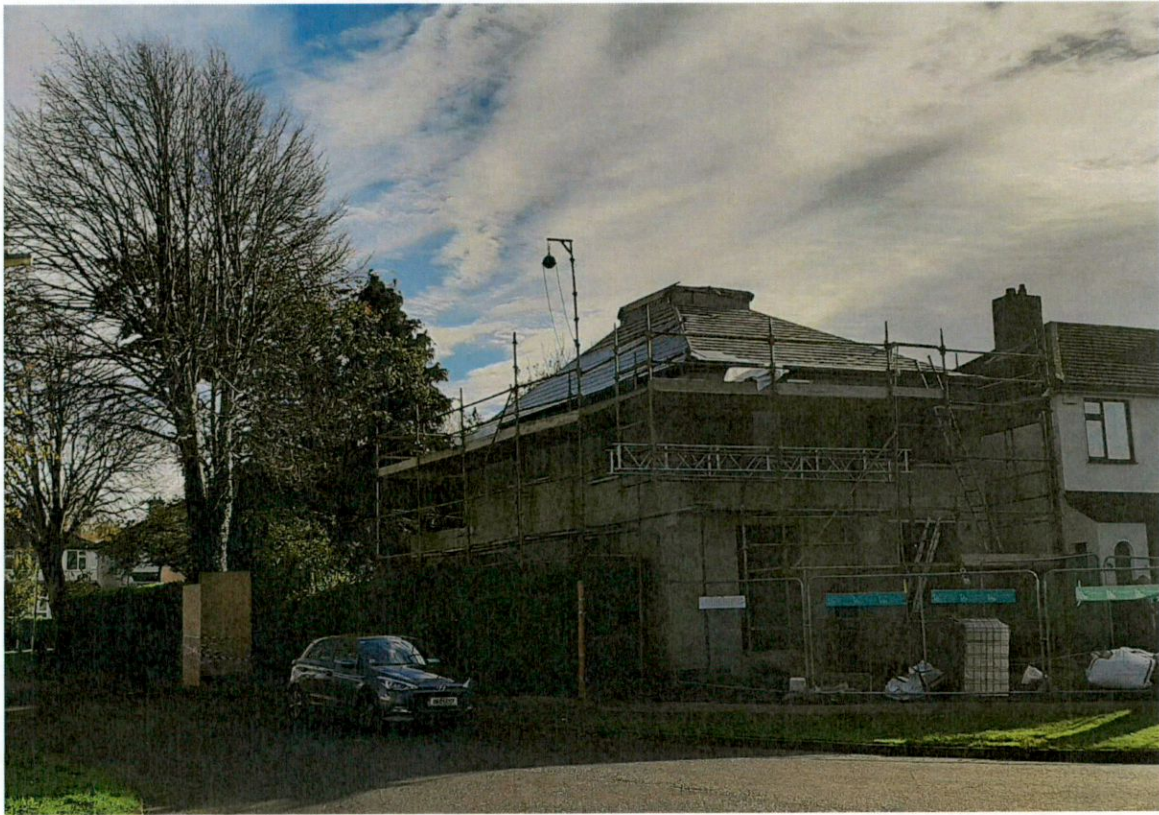
New house under construction, November 2022

As part of the original planning application, the existing hedgerow along the north eastern boundary was noted to be retained and supplanted where required. The hedgerow is a common Griselinia of low arboricultural value (as noted in the arborist's report accompanying the original application and re-submitted as part of this application). A section of hedgerow at the front of the site was already granted permission for removal.