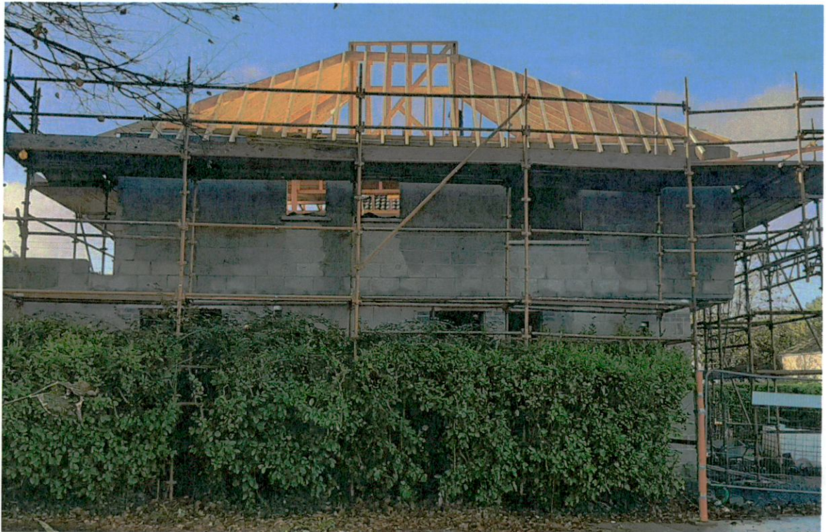
New house under construction, November 2022